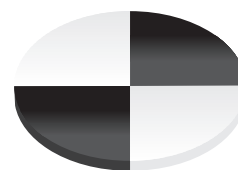
Fig. 20.1 A Secchi's Disc