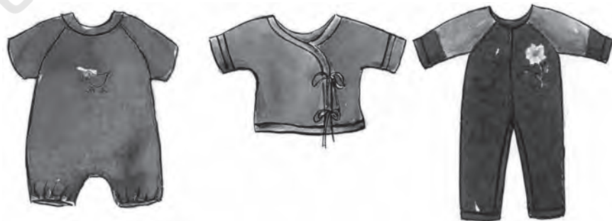
FIGURE 1: CLOTHES FOR INFANTS

Physically at this stage, the baby's skin is very delicate and sensitive and thus would demand very soft, light-in-weight and simple-to-put-on