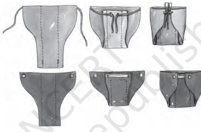
FIGURE 2: PRE-SHAPED DIAPERS

Undershirts are worn in most climates; depending on the weather and geographical location, the material for the undershirt should be selected suitably. Cotton undershirt is suitable for warm climate and soft wool-cotton blend shirts are suitable in cold climate. Usually, shirts and diapers form the basic garments for the infant. Cotton shirts in various styles that slip on easily are preferred.