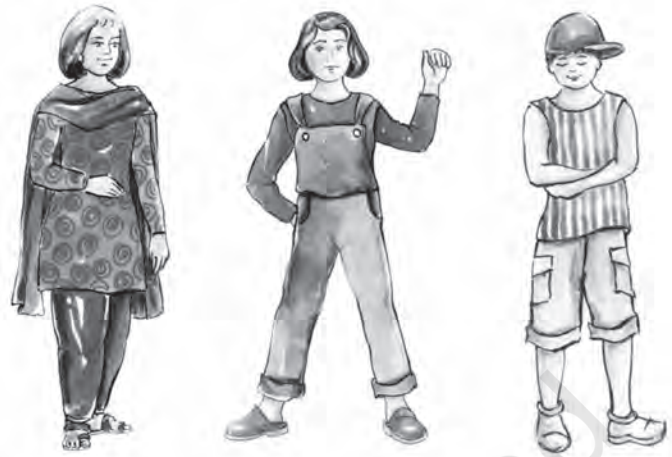
FIGURE 8: COMFORTABLE CLOTHING FOR ELEMENTARY SCHOOL AGE GROUP

To cater to their physical needs the children would require absorbent fabrics so as to absorb perspiration. Most suitable fabrics are cotton, voile, etc. Factors like safety, easy care, growth allowance and suitability to their physique are also important for school going children, just like younger children as has been discussed in the previous sections.