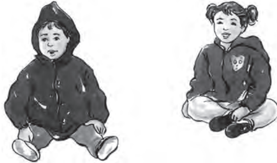
FIGURE 3: COMFORTABLE CLOTHES FOR CRAWLING AGE

be easier during play and will also be comparatively warmer to enmesh air, specially in winters. Do not make children wear too many clothes. The