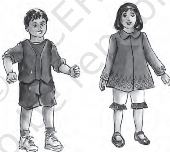
FIGURE 7: SPORTY AND COMFORTABLE DRESSES FOR 5–8 YEARS

They develop likes and dislikes for certain clothes to gain acceptance from their peers, and parents need to understand this developmental change. A sensitive child may experience humiliation and develop lack of confidence if her/his clothes appear very different from those of her/his peers.