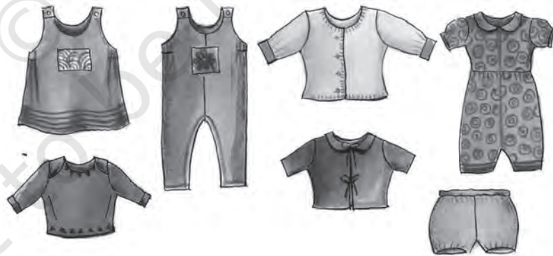
FIGURE 4: APPAREL DESIGNS SUITABLE FOR CRAWLING AGE

Most suitable garments for this age are rompers and sun-suits made from knitted or woven material.