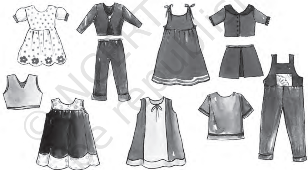
FIGURE 6: APPAREL FOR PRESCHOOLERS

The design features on the ready-to-wear preschooler's dress must provide ease in care. Sometimes dresses have trimmings that make the garment difficult to wash and iron. It should be such that it can withstand many launderings and hard wear. Be sure that fasteners and trimmings are securely attached, decorations are easy to iron, and seams are flat and well finished.