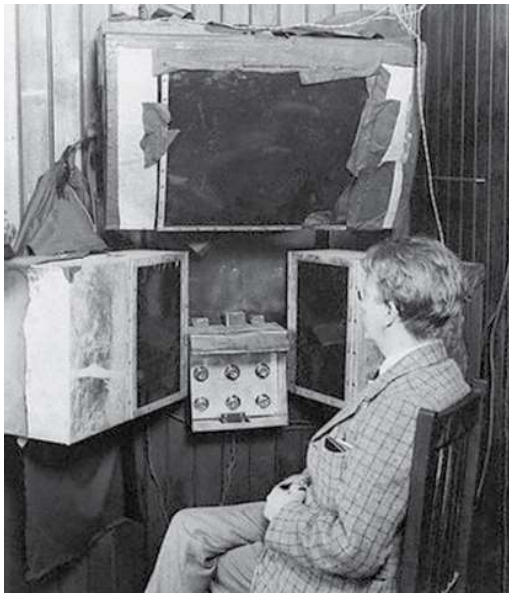
John L. Baird sits in front of the apparatus with which he demonstrated to the Royal Institute, his invention, the 'televisor', an early television.

Can you list three different products that are advertised during your favourite TV programme?