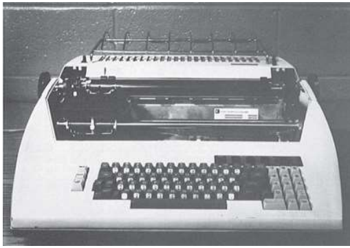
With electronic typewriters, journalism underwent a sea-change in the 1940s.