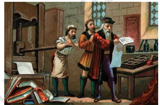
An artist's impression of Gutenberg printing the first sheet of the Bible.

Look at the collage on the left and list six various kinds of media that you see.