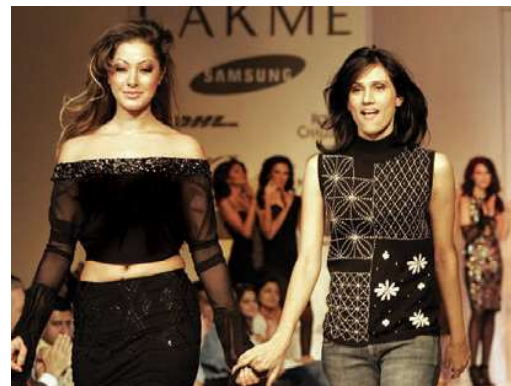
Fashion shows are very popular with the media.

As citizens of a democracy, the media has a very important role to play in our lives because it is through the media that we hear about issues related