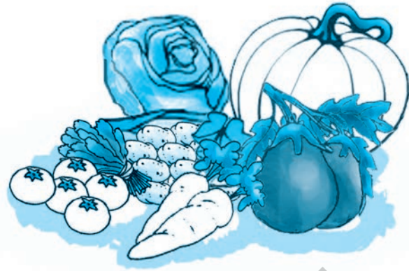
Fig. 1.2 : Healthy Diet

Eating a balanced diet helps in the prevention of obesity and other lifestyle diseases. The balanced diet includes fruits and vegetables, preferably locally available and seasonal, wholegrain products (including pulses), milk and milk products.