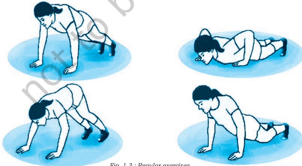
Fig. 1.3 : Regular exercises

One must do 20–30 minutes of physical activity daily to keep fit. This can be done by taking part in sports. Exercising or spot jogging can be done at home. Simple walking, climbing stairs, not using the lift and skipping have the same effect. Gym is another dedicated place for workouts.