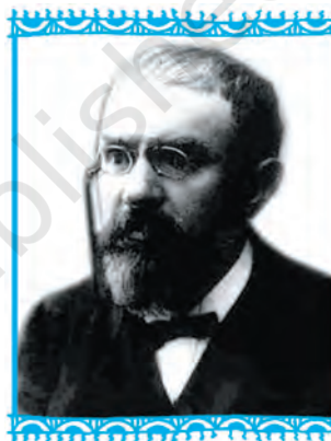
Henri Poincaré (1854-1912)

An equation of the form (1) is known as a differential equation . A formal definition will be given later.