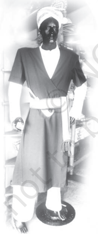
Traditional Coorgi dress