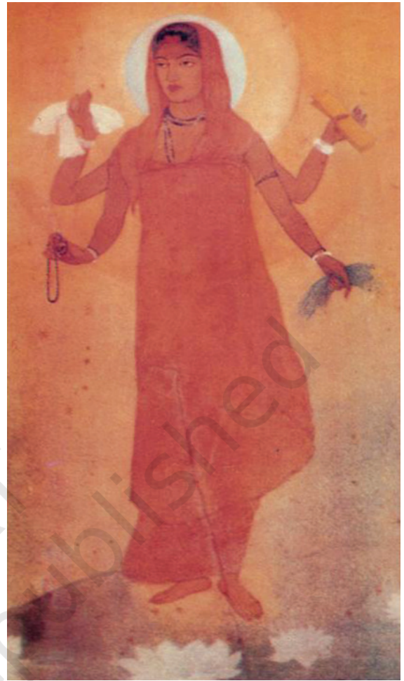
Fig. 12 – Bharat Mata, Abanindranath Tagore, 1905.

Ideas of nationalism also developed through a movement to revive Indian folklore. In late-nineteenth-century India, nationalists began recording folk tales sung by bards and they toured villages to gather folk songs and legends. These tales, they believed, gave a true picture of traditional culture that had been corrupted and damaged by outside forces. It was essential to preserve this folk tradition in order to discover one’s national identity and restore a sense of pride in one’s past. In Bengal, Rabindranath Tagore himself began collecting ballads, nursery rhymes and myths, and led the movement for folk