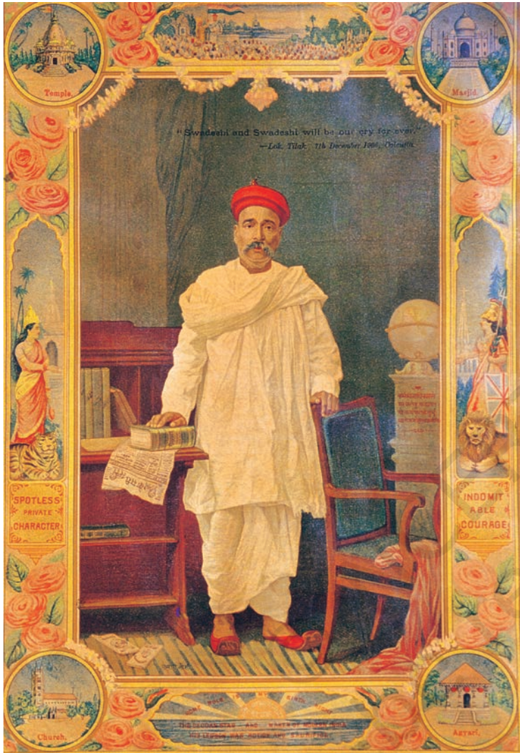
Fig. 11 – Bal Gangadhar Tilak, an early-twentieth-century print. Notice how Tilak is surrounded by symbols of unity. The sacred institutions of different faiths (temple, church, masjid) frame the central figure.

Nationalism spreads when people begin to believe that they are all part of the same nation, when they discover some unity that binds them together. But how did the nation become a reality in the minds of people? How did people belonging to different communities, regions or language groups develop a sense of collective belonging?