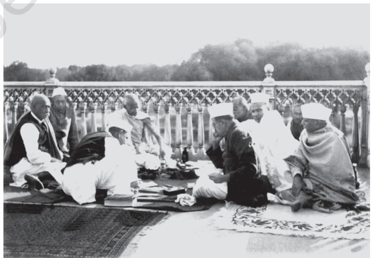
Fig. 6 – Meeting of Congress leaders at Allahabad, 1931. Apart from Mahatma Gandhi, you can see Sardar Vallabhbhai Patel (extreme left), Jawaharlal Nehru (extreme right) and Subhas Chandra Bose (fifth from right).

Lala Lajpat Rai was assaulted by the British police during a peaceful demonstration against the Simon Commission. He succumbed to injuries that were inflicted on him during the demonstration.