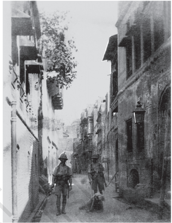
Fig. 3 – General Dyer's 'crawling orders' being administered by British soldiers, Amritsar, Punjab, 1919.

In his famous book Hind Swaraj (1909) Mahatma Gandhi declared that British rule was established in India with the cooperation of