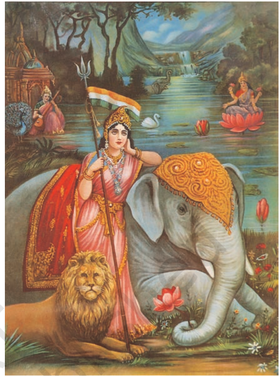
Fig. 14a – Bharat Mata.

This figure of Bharat Mata is a contrast to the one painted by Abanindranath Tagore. Here she is shown with a trishul, standing beside a lion and an elephant – both symbols of power and authority.