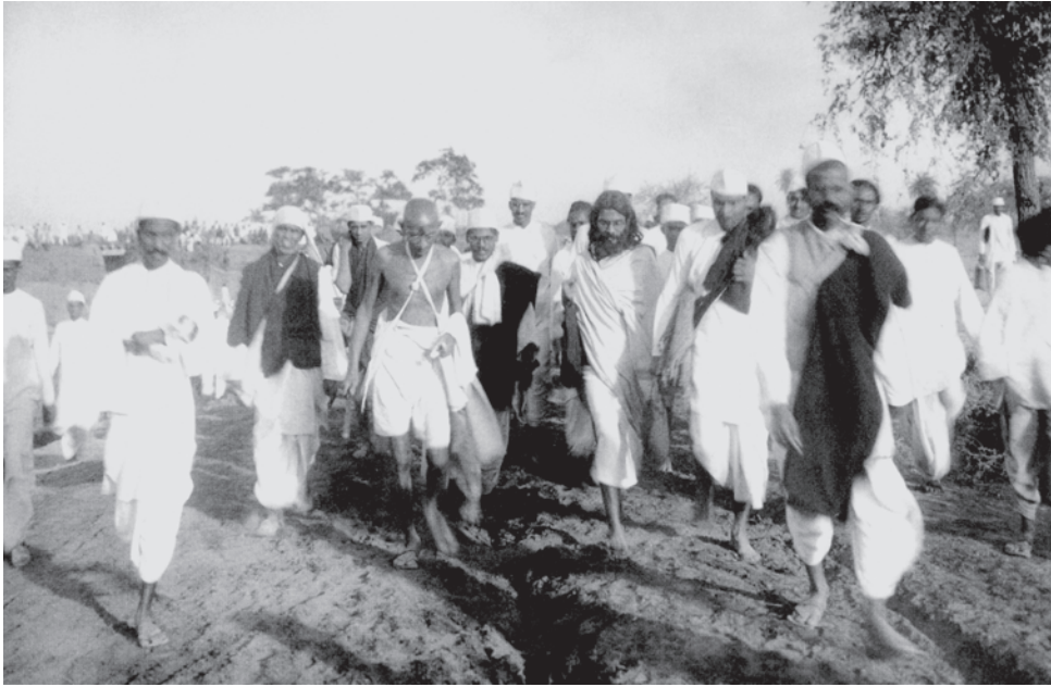
Fig. 7 – The Dandi march. During the salt march Mahatma Gandhi was accompanied by 78 volunteers. On the way they were joined by thousands.

with the British, as they had done in 1921-22, but also to break colonial laws. Thousands in different parts of the country broke the salt law, manufactured salt and demonstrated in front of government salt factories. As the movement spread, foreign cloth was boycotted, and liquor shops were picketed. Peasants refused to pay revenue and chaukidari taxes, village officials resigned, and in many places forest people violated forest laws – going into Reserved Forests to collect wood and graze cattle.