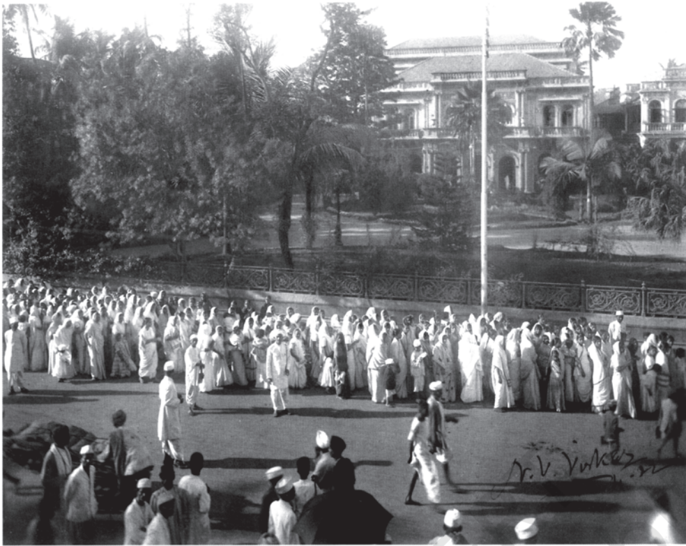
Fig. 9 – Women join nationalist processions. During the national movement, many women, for the first time in their lives, moved out of their homes on to a public arena. Amongst the marchers you can see many old women, and mothers with children in their arms.

picketed foreign cloth and liquor shops. Many went to jail. In urban areas these women were from high-caste families; in rural areas they came from rich peasant households. Moved by Gandhiji's call, they began to see service to the nation as a sacred duty of women. Yet, this increased public role did not necessarily mean any radical change in the way the position of women was visualised. Gandhiji was convinced that it was the duty of women to look after home and hearth, be good mothers and good wives. And for a long time the Congress was reluctant to allow women to hold any position of authority within the organisation. It was keen only on their symbolic presence.