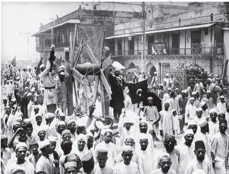
Fig. 4 – The boycott of foreign cloth, July 1922. Foreign cloth was seen as the symbol of Western economic and cultural domination.

Boycott – The refusal to deal and associate with people, or participate in activities, or buy and use things; usually a form of protest