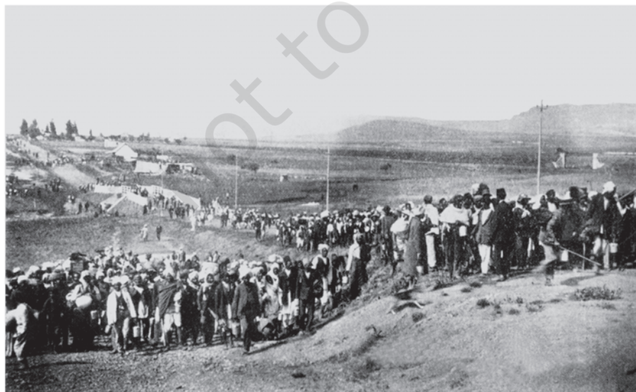
Fig. 2 – Indian workers in South Africa march through Volksrust, 6 November 1913.

Forced recruitment – A process by which the colonial state forced people to join the army