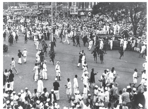
Fig. 8 – Police cracked down on satyagrahis, 1930.

In such a situation, Mahatma Gandhi once again decided to call off the movement and entered into a pact with Irwin on 5 March 1931. By this Gandhi-Irwin Pact, Gandhiji consented to participate in a Round Table Conference (the Congress had boycotted the first