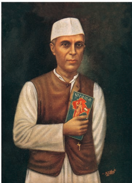
Fig. 13 – Jawaharlal Nehru, a popular print.

Notice that the mother figure here is shown as dispensing learning, food and clothing. The mala in one hand emphasises her ascetic quality. Abanindranath Tagore, like Ravi Varma before him, tried to develop a style of painting that could be seen as truly Indian.