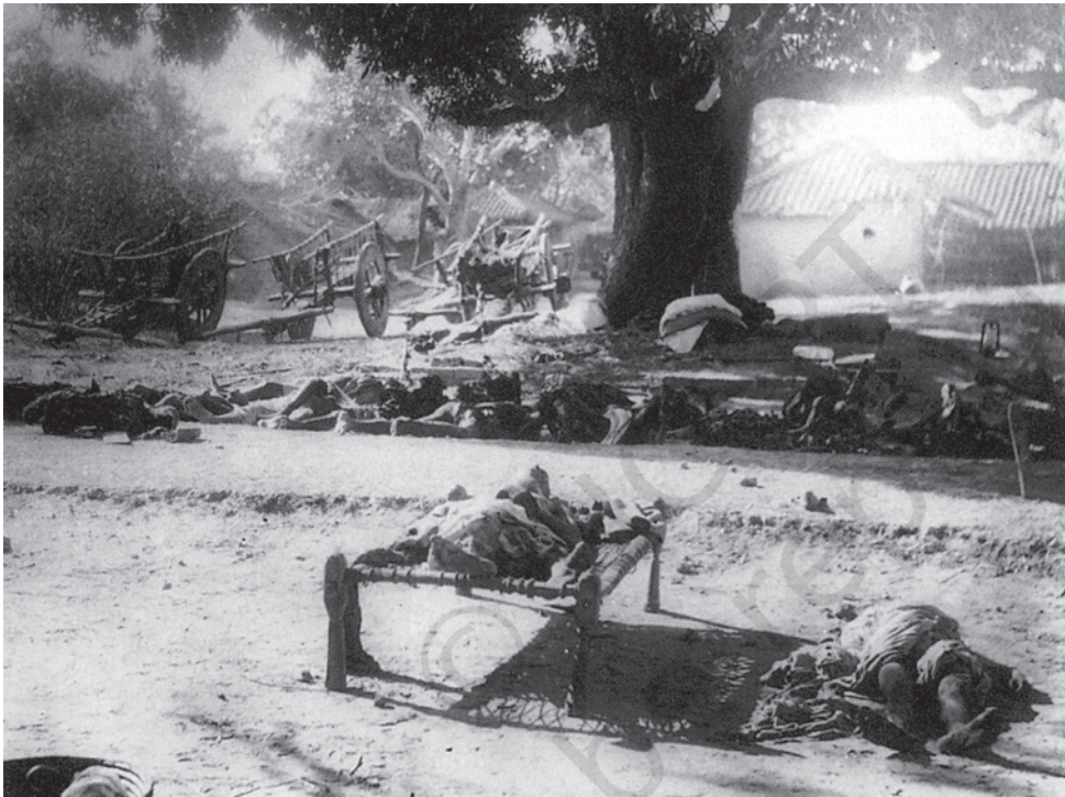
Fig. 5 – Chauri Chaura, 1922.

The visions of these movements were not defined by the Congress programme. They interpreted the term swaraj in their own ways, imagining it to be a time when all suffering and all troubles would be over. Yet, when the tribals chanted Gandhiji's name and raised slogans demanding ' Swatantra Bharat ', they were also emotionally relating to an all-India agitation. When they acted in the name of Mahatma Gandhi, or linked their movement to that of the Congress, they were identifying with a movement which went beyond the limits of their immediate locality.