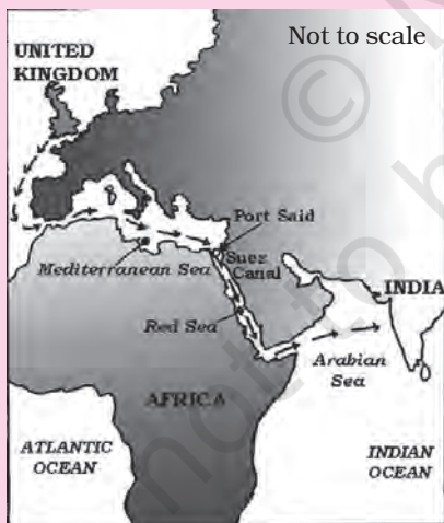
Fig.1.2 Suez Canal: Used as highway between India and Britain

Various details about the population of British India were first collected through a census in 1881. Though suffering from certain limitations, it revealed the unevenness in India's population growth. Subsequently,