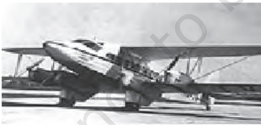
Fig.1.5 Tata Airlines, a division of Tata and Sons, was established in 1932 inaugurating the aviation sector in India

cost to the government exchequer, yet, it failed to compete with the railways, which soon traversed the region running parallel to the canal, and had to be ultimately abandoned. The introduction of the expensive system of electric telegraph in India, similarly, served the purpose of maintaining law and order. The postal services, on the other hand, despite serving a useful public purpose, remained all through inadequate.