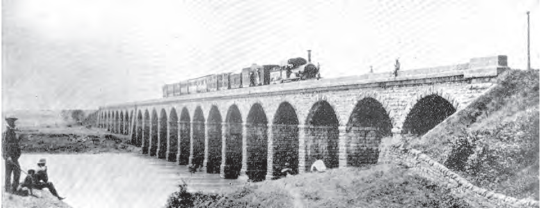
Fig. 1.4 First Railway Bridge linking Bombay with Thane, 1854

Indian people gained owing to the introduction of the railways, were thus outweighed by the country's huge economic loss.