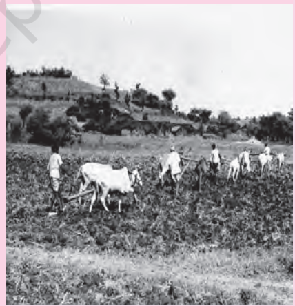
Fig. 1.1 India's agricultural stagnation under the British colonial rule

The French traveller, Bernier, described seventeenth century Bengal in the following way: "The knowledge I have acquired of Bengal in two visits inclines me to believe that it is richer than Egypt. It exports, in abundance, cottons and silks, rice, sugar and butter. It produces amply — for its own consumption — wheat, vegetables, grains, fowls, ducks and geese. It has immense herds of pigs and flocks of sheep and goats. Fish of every kind it has in profusion. From rajmahal to the sea is an endless number of canals, cut in bygone ages from the Ganges by immense labour for navigation and irrigation."