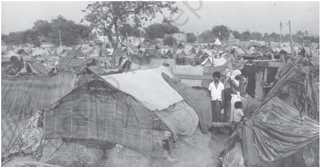
Fig. 1.3 A large section of India's population did not have basic needs such as housing

During the colonial period, the occupational structure of India, i.e., distribution of working persons across different industries and sectors, showed little sign of change. The agricultural sector accounted for