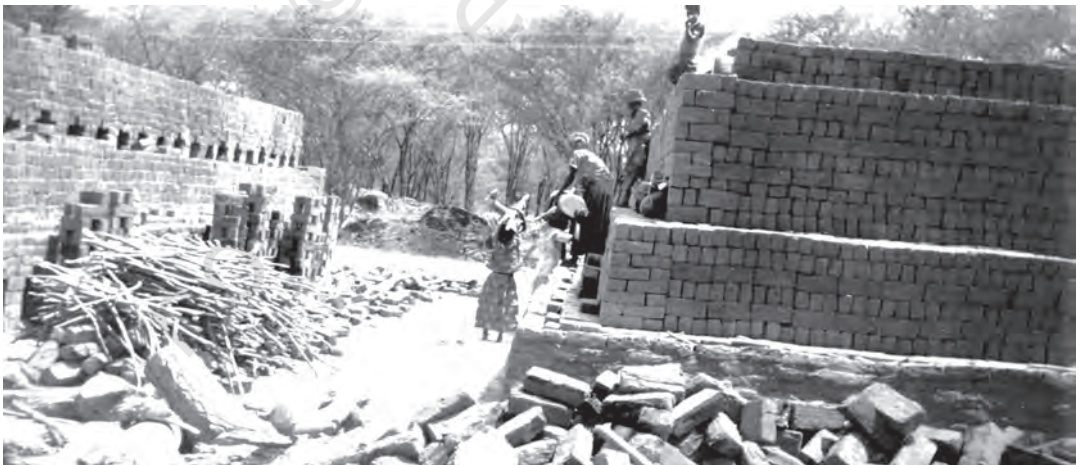
Fig. 4.6 School dropouts give way to child labour: a loss to human capital

Education for All — Still a Distant Dream: Though literacy rates for both — adults as well as youth — have increased, still the absolute number of illiterates in India is as much as India's population was at the time of independence. In 1950, when the Constitution of India was passed by the Constituent Assembly, it was noted in the Directive Principles of the