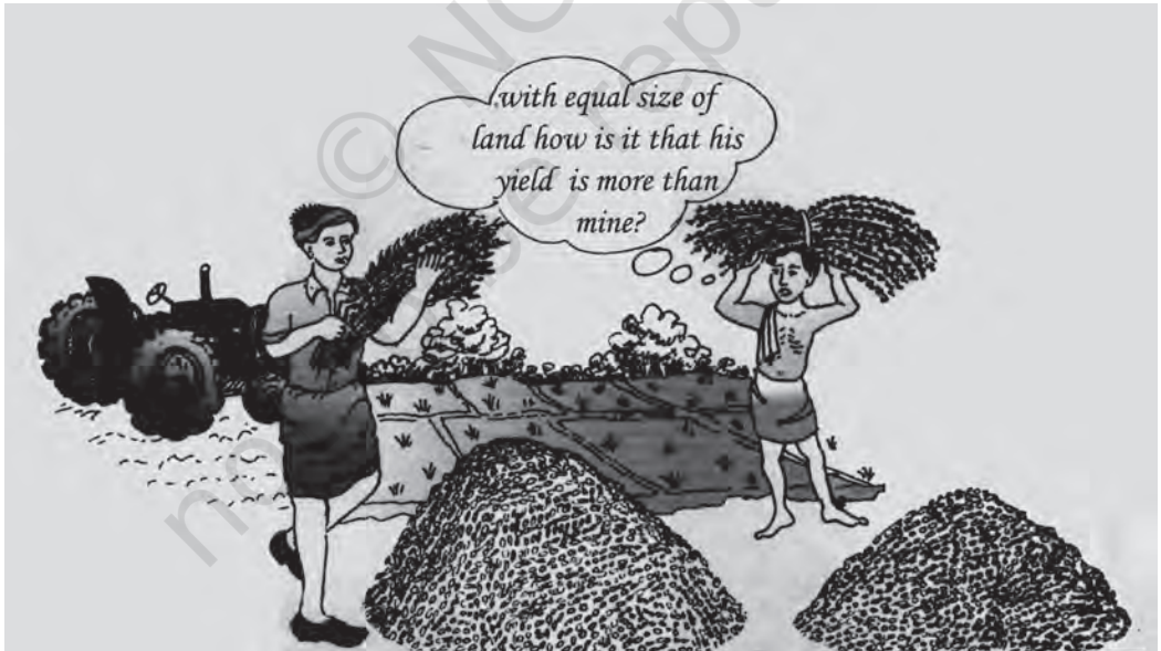
Fig. 4.1 Adequate education and training to farmers can raise productivity in farms

Education is sought not only as it confers higher earning capacity on people but also for its other highly valued benefits: it gives one a better social standing and pride; it enables one to make better choices in life; it provides knowledge to understand the changes taking place in society; it also stimulates innovations. Moreover, the availability of educated labour force facilitates adaptation of new