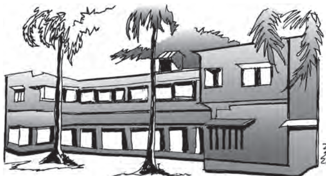
Fig. 4.5 Investment in educational infrastructure is inevitable

One can understand the inadequacy of the expenditure on education if we compare it with the desired level of education expenditure as recommended by the various commissions. The Education Commission (1964–66) had recommended that at least 6 per cent of GDP be spent on education so as to make a noticeable rate of growth in educational achievements. The Tapas Majumdar Committee, appointed by the Government of India in 1999, estimated an expenditure of around Rs 1.37 lakh crore over 10 years (1998-