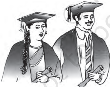
Fig. 4.7 Higher Education: few takers

unemployment among educated youth is the highest. As per NSSO data, in the year 2011-12, the rate of unemployment among youth males who studied graduation and above in rural areas was 19 per cent. Their urban counterparts had relatively less level of unemployment at 16 per cent. The most severely affected ones were young rural female graduates as nearly 30 per cent of them are unemployed. In contrast to this, only about 3-6 per cent of primary level educated youth in rural and urban areas were unemployed. The situation is yet to improve as indicated by the Periodic Labour Force Survey 2017-18. Therefore, the government should increase allocation for higher education and also improve the standard of higher education institutions, so that students are imparted employable skills in such institutions. When compared to less educated, a large proportion of educated persons are unemployed. Why?