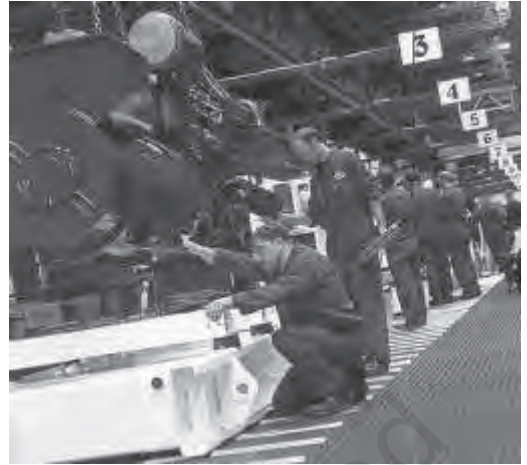
Fig. 4.3 Scientific and technical manpower: a rich ingredient of human capital

Empirical evidence to prove that increase in human capital causes economic growth is rather nebulous. This may be because of measurement problems. For example, education measured in terms of years of schooling, teacher-pupil ratio and enrolment rates may not reflect the quality of education; health services measured in monetary terms, life expectancy and mortality rates may not reflect the true health status of the people in a country. Using the indicators mentioned above, an analysis of improvement in education and health sectors and growth in real per capita income in both developing and developed countries shows that there is convergence in the measures of human capital but no sign of convergence of per capita real income. In other words, the human capital growth in developing countries has been faster but the growth of per capita real income has not been that fast. There are reasons to believe that the