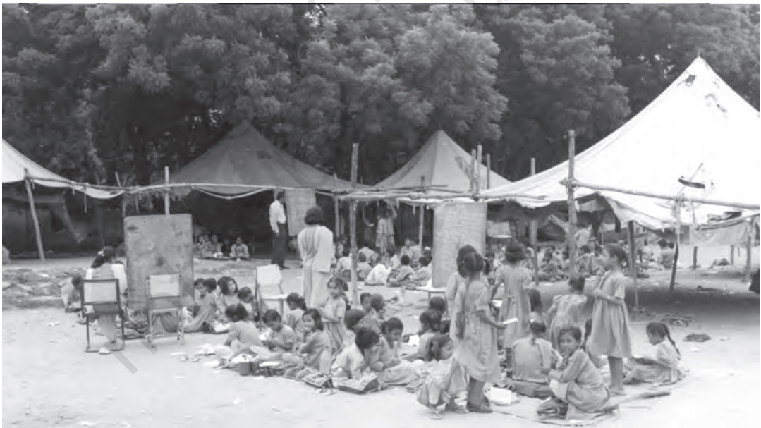
Fig. 4.2 Creating human capital: a school being run in make shift premises in Delhi

uninterrupted labour supply for a longer period of time, then health is also an important factor for economic growth. Thus, both education and health, along with many other factors like on-the-job training, job market information and migration, increase an