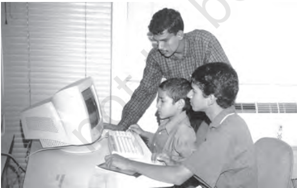
Fig. 4.4 Job on hand: transforming India into a knowledge economy

workforce, particularly involving mathematics, computer science, and data science, in conjunction with multidisciplinary abilities across the sciences and social sciences, and humanities, will be increasingly in greater demand. With climate change, increasing pollution, and depleting natural resources, there will be a sizeable shift in how we meet the world's energy, water, food, and sanitation needs, again resulting in the need for new skilled labour, particularly in biology, chemistry, physics, agriculture, climate science, and social science. The growing emergence of epidemics and pandemics will also call for collaborative research in infectious disease management and development of vaccines and the resultant social issues heightens the need for multidisciplinary learning. There will be a growing demand for humanities and art, as India moves towards becoming a developed country as well as