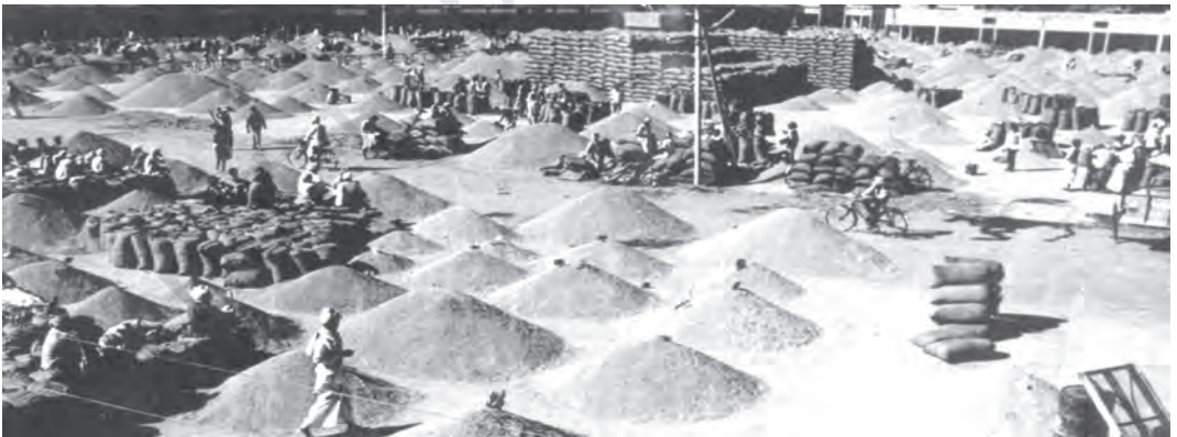
Fig. 5.1 Regulated market yards benefit farmers as well as consumers

Let us discuss four such measures that were initiated to improve the marketing aspect. The first step was regulation of markets to create orderly and transparent marketing conditions. By and large, this policy benefited farmers as well as consumers. However, there is still a need to develop about 27,000 rural periodic markets as regulated market places to realise the full potential of rural markets. Second component is provision of physical infrastructure facilities like roads, railways, warehouses, godowns, cold storages and processing units. The current infrastructure facilities are quite inadequate to meet the growing demand and need to be improved. Cooperative