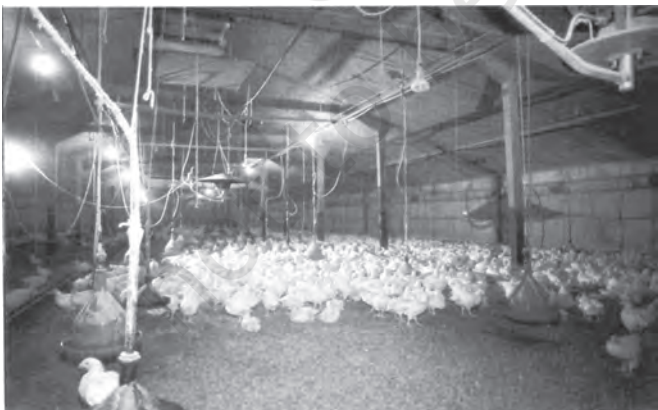
Fig. 5.4 Poultry has the largest share of total livestock in India

However problems related to over-fishing and pollution need to be regulated