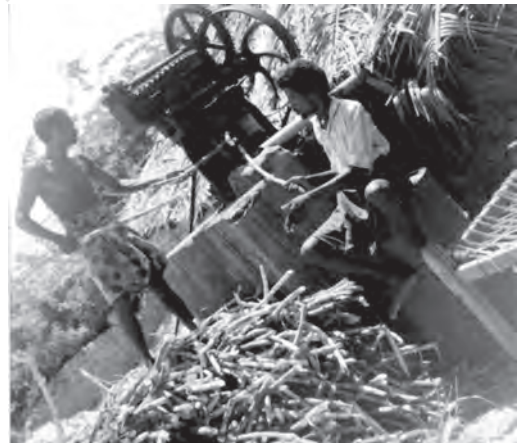
Fig. 5.2 Jaggery making is an allied activity of the farming sector

greater risk in depending exclusively on farming for livelihood. Diversification towards new areas is necessary not only to reduce the risk from agriculture sector but also to provide productive sustainable livelihood options to rural people. Much of the agricultural employment activities are concentrated in the Kharif season. But during the Rabi season, in areas where there are inadequate irrigation facilities, it becomes difficult to find gainful employment. Therefore expansion into other sectors is essential to provide supplementary gainful employment and in realising higher levels of income for rural people to overcome poverty and other tribulations. Hence, there is a need to focus on allied activities, non-farm employment and other emerging alternatives of livelihood, though there are many other options available for providing sustainable livelihoods in rural areas.