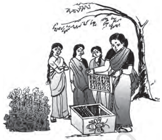
Fig. 5.5 Women in rural households take up beekeeping as an entrepreneurial activity

Horticulture: Blessed with a varying climate and soil conditions, India has adopted growing of diverse horticultural crops such as fruits, vegetables, tuber crops, flowers, medicinal and aromatic plants, spices and plantation crops. These crops play a vital role in providing food and nutrition, besides addressing employment concerns. Horticulture sector contributes nearly one-third of the value of agriculture output and six per cent of Gross Domestic Product of India. India has emerged as a world leader in producing a variety of fruits like mangoes, bananas, coconuts, cashew nuts and a number of spices and is the second largest producer of fruits and vegetables. Economic condition of many farmers engaged in horticulture has improved and it has become a means of improving livelihood for many unprivileged classes. Flower harvesting, nursery