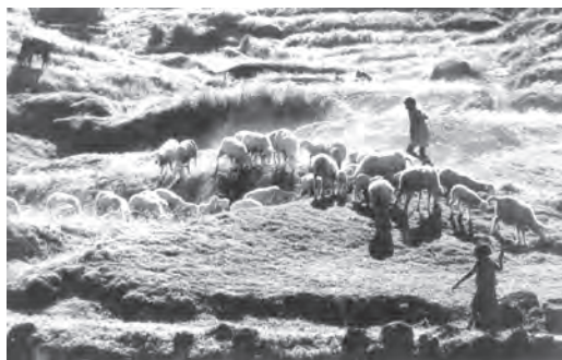
Fig. 5.3 Sheep rearing — an important income augmenting activity in rural areas

followed by others. Other animals which include camels, asses, horses, ponies and mules are in the lowest rung. India had about 303 million cattle, including 110 million buffaloes in 2019. Performance of the Indian dairy sector over the last three decades has been quite impressive. Milk production in the country has increased by about ten times between 1951-2016. This can be attributed mainly to the successful implementation of 'Operation Flood'. It is a system whereby all the farmers can pool their milk produced according to different grading (based on quality), processed and marketed to urban centres through cooperatives. In this system the farmers are assured of a fair price and income from the supply of milk to urban markets. As pointed out earlier Gujarat state is held as a success story in the efficient implementation of milk cooperatives which has been emulated by many states. Gujarat, Madhya Pradesh, Uttar Pradesh, Andhra Pradesh, Maharashtra, Punjab and Rajasthan, are major milk producing states. Meat, eggs, wool and other by-products are