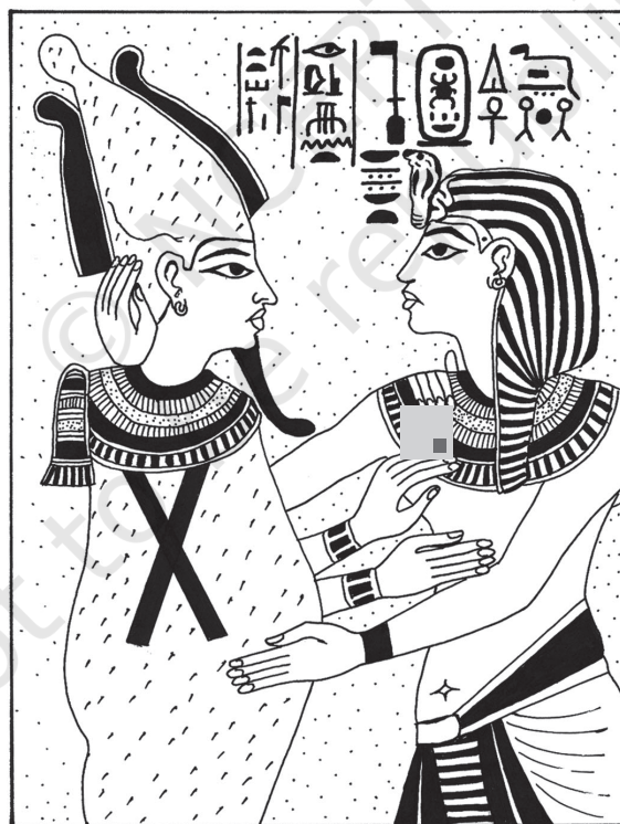
Mural in King Tut's tomb showing King Tut with Osiris, the god of the afterlife

Back in the trailer a technician pulled up astonishing images of Tut on a computer screen. A grey head took shape from a scattering of pixels, and the technician spun and tilted it in every direction. Neck vertebrae appeared as clearly as in an anatomy class. Other images revealed a hand, several views of the rib cage, and a transection of the skull. But for now the pressure was off. Sitting back in his chair, Zahi Hawass smiled, visibly relieved that nothing had gone seriously wrong. "I didn't sleep last night, not for a second," he said. "I was so worried. But now I think I will go and sleep."