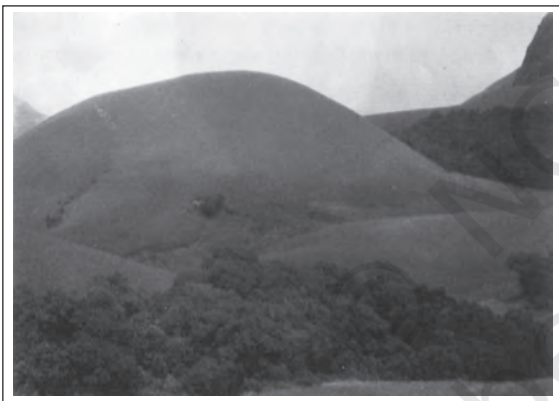
Figure 14.1 : Grasslands and sholas in Indira Gandhi National Park, Annamalai, Western Ghats — an example of ecosystem diversity

You have studied about the ecosystem in the earlier chapter. The broad differences between ecosystem types and the diversity of habitats and ecological processes occurring within each ecosystem type constitute the ecosystem diversity. The 'boundaries' of communities (associations of species) and ecosystems are not very rigidly defined. Thus, the demarcation of ecosystem boundaries is difficult and complex.