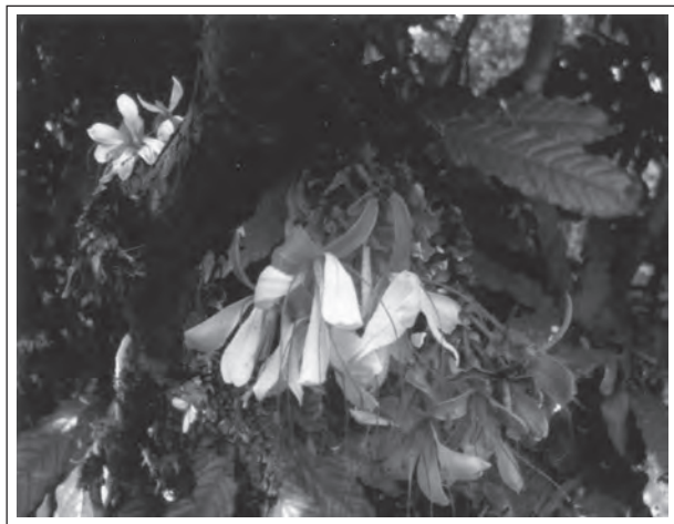
Figure 14.3 : Humboldtia decurrens Bedd — highly rare endemic tree of Southern Western Ghats (India)

There is an urgent need to educate people to adopt environment-friendly practices and reorient their activities in such a way that our development is harmonious with other life forms and is sustainable. There is an increasing consciousness of the fact that such conservation with sustainable use is possible only with the involvement and cooperation of local communities and individuals. For this, the development of institutional structures at local levels is necessary. The critical problem is not merely the conservation of species nor the habitat but the continuation of process of conservation.