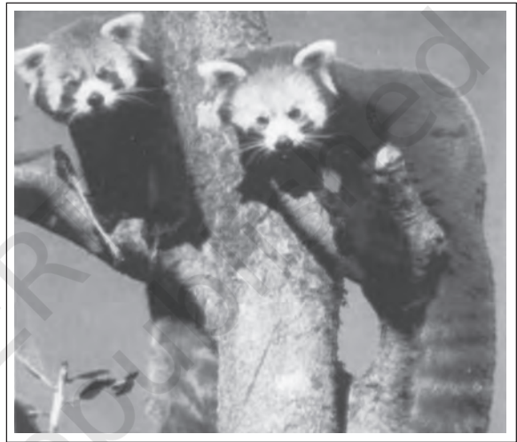
Figure 14.2 : Red Panda — an endangered species

It includes those species which are in danger of extinction. The IUCN publishes information about endangered species world-wide as the Red List of threatened species.