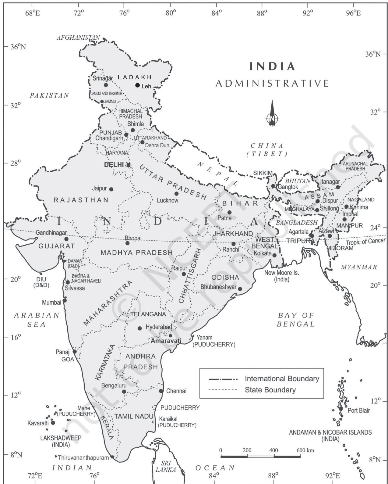
Figure 1.1 : India : Administrative Divisions