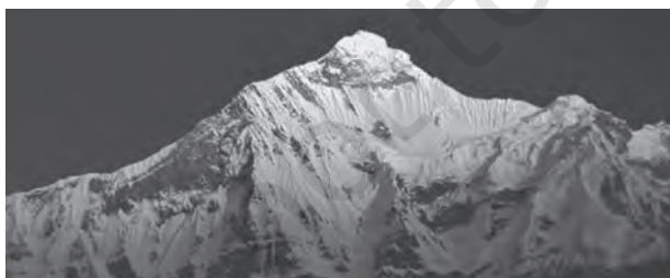
Figure 2.3 : The Himalayas

Himalayas are not only the physical barrier, they are also a climatic, drainage and cultural divide. Can you identify the impact of Himalayas on the geoenvironment of the countries of South Asia? Can you find some other examples of similar geoenvironmental divide in the world?