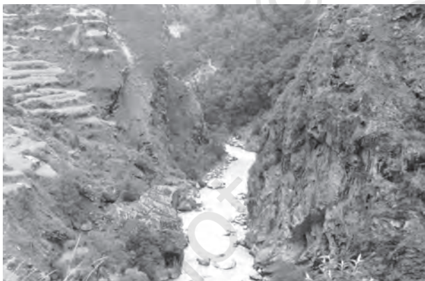
Figure 2.1 : A Gorge

The Himalayas along with other Peninsular mountains are young, weak and flexible in their geological structure unlike the rigid and stable Peninsular Block. Consequently, they are still subjected to the interplay of exogenic and endogenic forces, resulting in the development of faults, folds and thrust plains. These