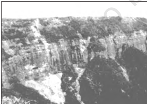
Figure 2.5 : A Part of Peninsular Plateau

Rising from the height of 150 m above the river plains up to an elevation of 600-900 m is the irregular triangle known as the Peninsular plateau. Delhi ridge in the northwest, (extension of Aravalis), the Rajmahal hills in the east, Gir range in the west and the Cardamom hills in the south constitute the outer extent of the Peninsular plateau. However, an extension of this is also seen in the northeast, in the form of Shillong and Karbi-Anglong plateau. The Peninsular India is made up of a series of patland plateaus such as the Hazaribagh