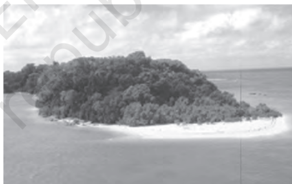
Figure 2.8 : An Island

The islands of the Arabian sea include Lakshadweep and Minicoy. These are scattered between 8°N-12°N and 71°E -74°E longitude. These islands are located at a distance of 220 km-440 km off the Kerala coast. The entire island group is built of coral deposits. There are approximately 36 islands of which 11 are inhabited. Minicoy is the largest island with an area of 453 sq. km. The entire group of islands is broadly divided by the Nine degree channel, north of which is the Amini Island and to the south of the Canannore Island. The Islands of this archipelago have storm beaches consisting of unconsolidated pebbles, shingles, cobbles and boulders on the eastern seaboard.