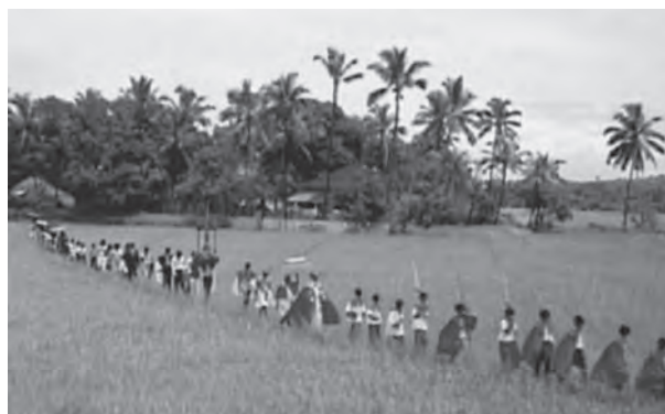
Figure 2.7 : Coastal Plains

As compared to the western coastal plain, the eastern coastal plain is broader and is an example of an emergent coast. There are well-developed deltas here, formed by the rivers flowing eastward in to the Bay of Bengal. These include the deltas of the Mahanadi, the Godavari, the Krishna and the Kaveri. Because of its emergent nature, it has less number of ports and harbours. The continental shelf extends up to 500 km into the sea, which makes it difficult for the development of good ports and harbours. Name some ports on the eastern coast.