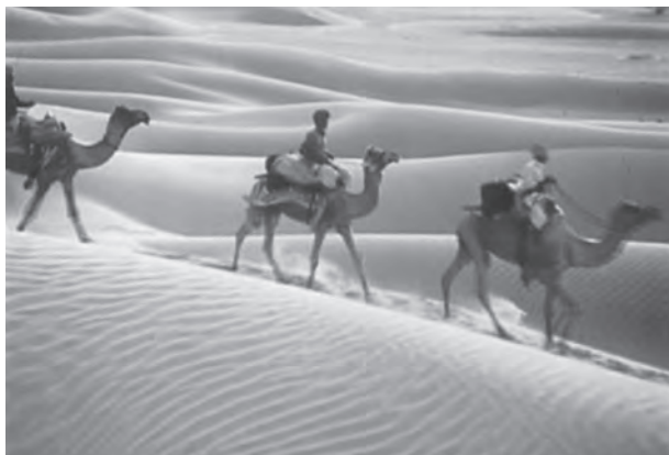
Figure 2.6 : The Indian Desert

Can you identify the type of sand dunes shown in this picture?