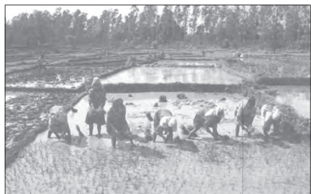
Figure 2.4 : Northern Plain

The south of Tarai is a belt consisting of old and new alluvial deposits known as the Bhangar and Khadar respectively. These plains have characteristic features of mature stage of fluvial erosional and depositional landforms such as sand bars, meanders, oxbow lakes and braided channels. The Brahmaputra plains are known for their riverine islands and sand bars. Most of these areas are subjected to periodic floods