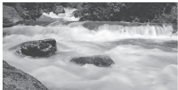
Figure 3.3 : Rapids

The Himalayan drainage system has evolved through a long geological history. It mainly includes the Ganga, the Indus and the Brahmaputra river basins. Since these are fed both by melting of snow and precipitation, rivers of this system are perennial. These rivers pass through the giant gorges carved out by the erosional activity carried on simultaneously with the uplift of the Himalayas. Besides deep gorges, these rivers also form V-shaped valleys, rapids and waterfalls in their mountainous