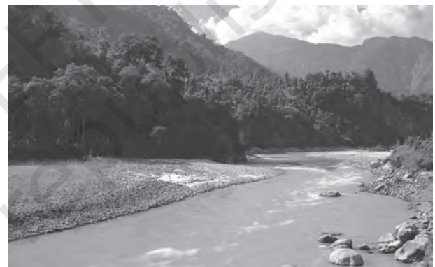
Figure 3.1 : A River in the Mountainous Region

2006) in this class. Can you, then, explain the reason for water flowing from one direction to the other? Why do the rivers originating from the Himalayas in the northern India and the Western Ghat in the southern India flow towards the east and discharge their waters in the Bay of Bengal?