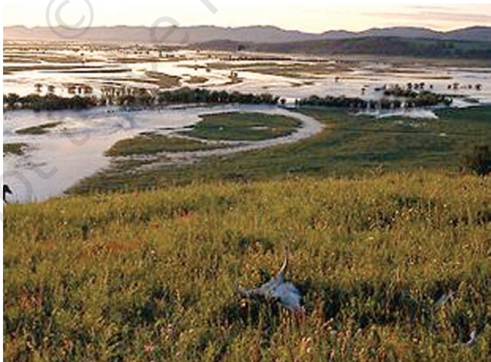
Onon river plain in flood.

The Mongols were a diverse body of people, linked by similarities of language to the Tatars, Khitan and Manchus to the east, and the Turkic tribes to the west. Some of the Mongols were pastoralists while others were hunter-gatherers. The pastoralists tended horses, sheep and, to a lesser extent, cattle, goats and camels. They nomadised in the steppes of Central Asia in a tract of land in the area of the modern state of Mongolia. This was (and still is) a majestic landscape with wide horizons, rolling plains, ringed by the snow-capped Altai mountains to the west, the arid Gobi desert in the south and drained by the Onon and Selenga rivers and myriad springs from the melting snows of the hills in the north and the west. Lush, luxuriant grasses for pasture and considerable small game were available in a good season. The hunter-gatherers resided to the north of the