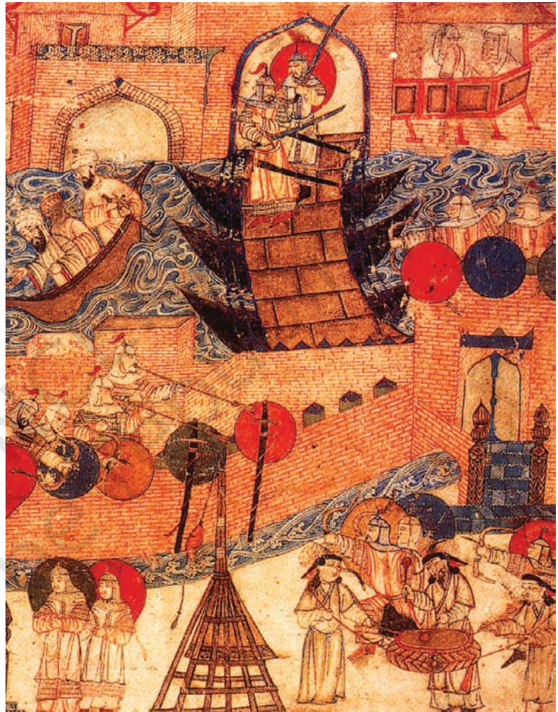
The Capture of Baghdad by the Mongols, a miniature painting in the Chronicles of Rashid al-Din, Tabriz, fourteenth century.

Today, after decades of Soviet control, the country of Mongolia is recreating its identity as an independent nation. It has seized upon Genghis Khan as a great national hero who is publicly venerated and whose achievements are recounted with pride. At a crucial juncture in the history of Mongolia, Genghis Khan has once again appeared as an iconic figure for the Mongol people, mobilising memories of a great past in the forging of national identity that can carry the nation into the future.