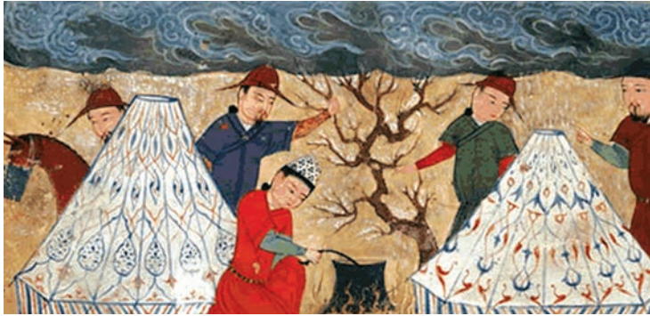
Kublai Khan and Chabi in camp.