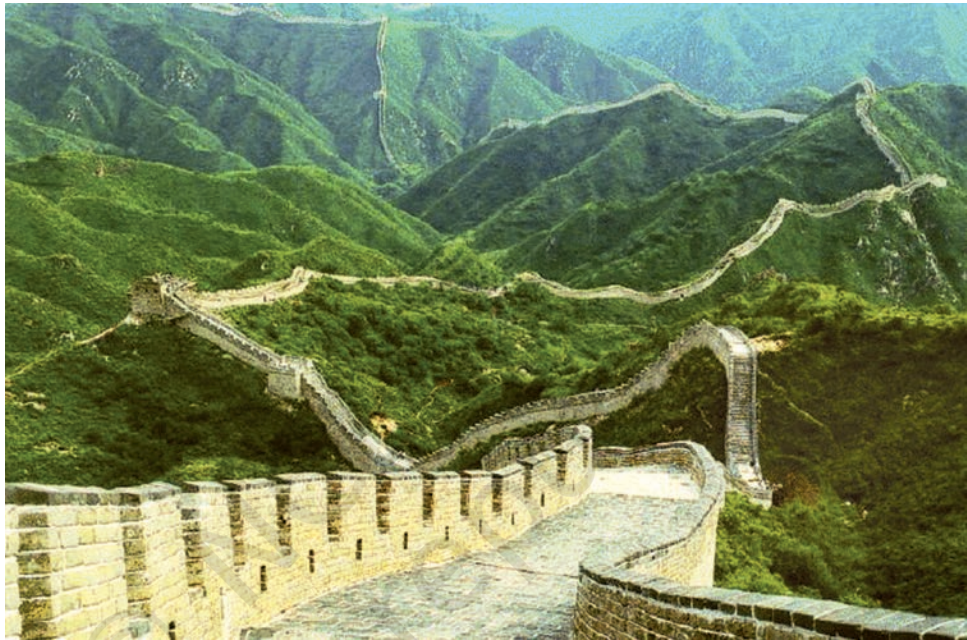
The Great Wall of China.

marginal losses. Throughout its history, China suffered extensively from nomad intrusion and different regimes – even as early as the eighth century BCE – built fortifications to protect their subjects. Starting from the third century BCE, these fortifications started to be integrated into a common defensive outwork known today as the ‘Great Wall of China’ a dramatic visual testament to the disturbance and fear perpetrated by nomadic raids on the agrarian societies of north China.