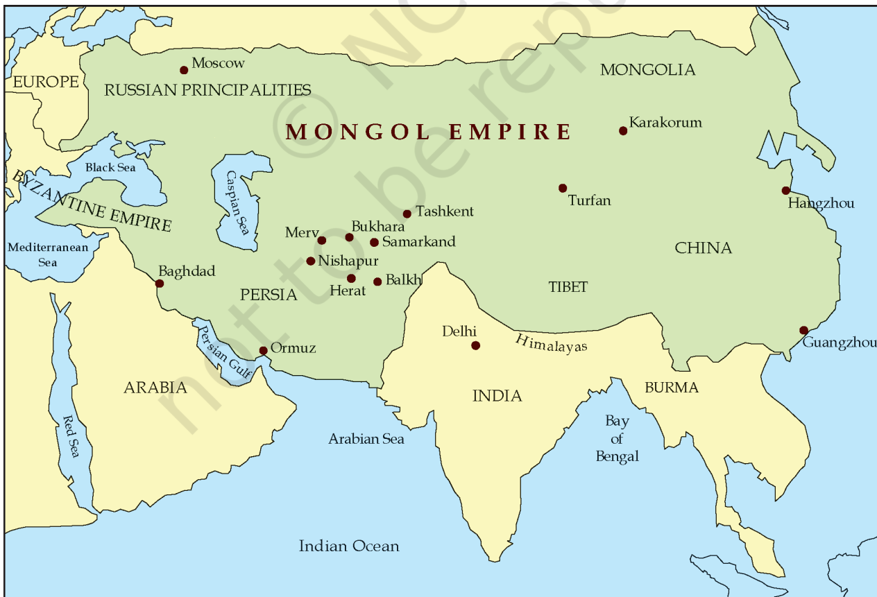
MAP 1: The Mongol Empire

In the early decades of the thirteenth century the great empires of the Euro-Asian continent realised the dangers posed to them by the arrival of a new political power in the steppes of Central Asia: Genghis Khan (d. 1227) had united the Mongol people. Genghis Khan's political vision, however, went far beyond the creation of a confederacy of Mongol