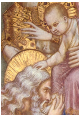
Giotto's painting of the child Jesus, Assisi, Italy.

to be known because of Dante Alighieri (1265-1321), a layman who wrote on religious themes, and Giotto (1267-1337), an artist who painted lifelike portraits, very different from the stiff figures done by earlier artists. From then it developed as the most exciting intellectual city in Italy and as a centre of artistic creativity. The term 'Renaissance Man' is often used to describe a person with many interests and skills, because many of the individuals who became well known at this time were people of many parts. They were scholar-diplomat-theologian-artist combined in one.