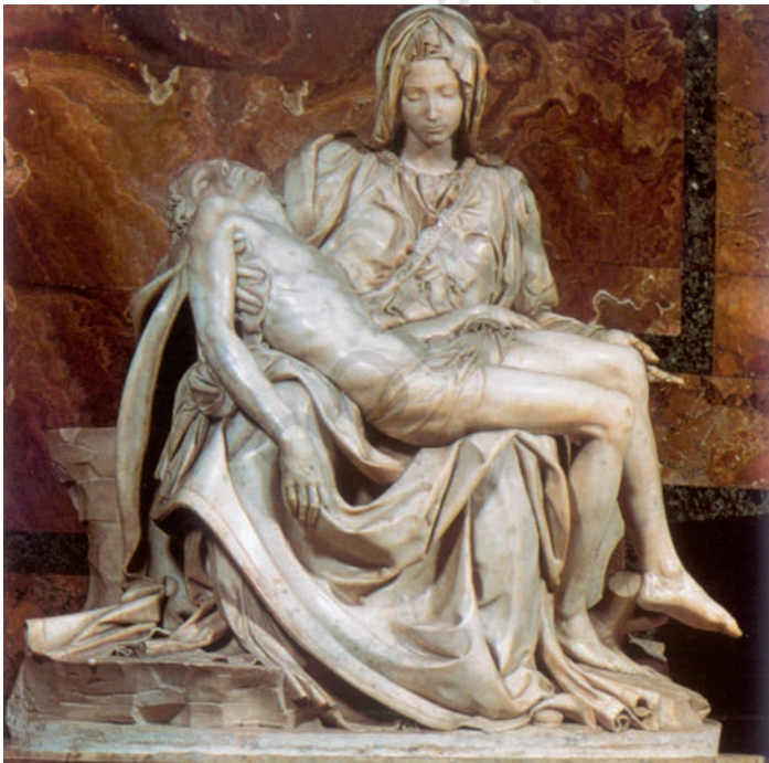
'The Pieta' by Michelangelo depicts Mary holding the body of Jesus.

Artists were inspired by studying works of the past. The material remains of Roman culture were sought with as much excitement as ancient texts: a thousand years after the fall of Rome, fragments of art were discovered in the ruins of ancient Rome and other deserted cities. Their admiration for the figures of 'perfectly' proportioned men and women sculpted so many centuries ago, made Italian sculptors want to continue that tradition. In 1416, Donatello (1386-1466) broke new ground with his lifelike statues.