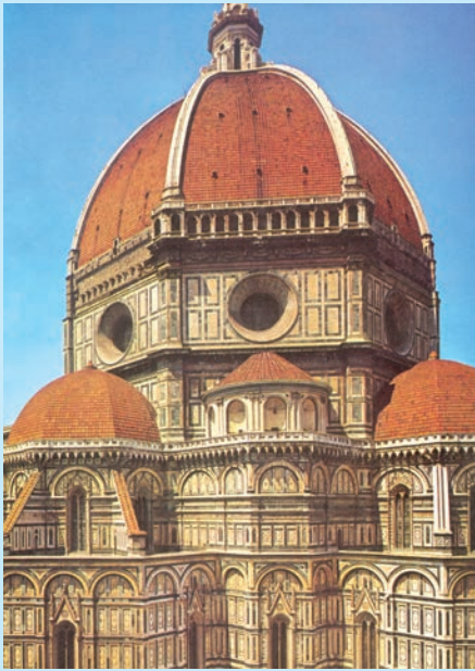
The Duomo, the dome of Florence cathedral designed by Brunelleschi.

Another remarkable change was that from this time, artists were known individually, by name, not as members of a group or a guild, as earlier.