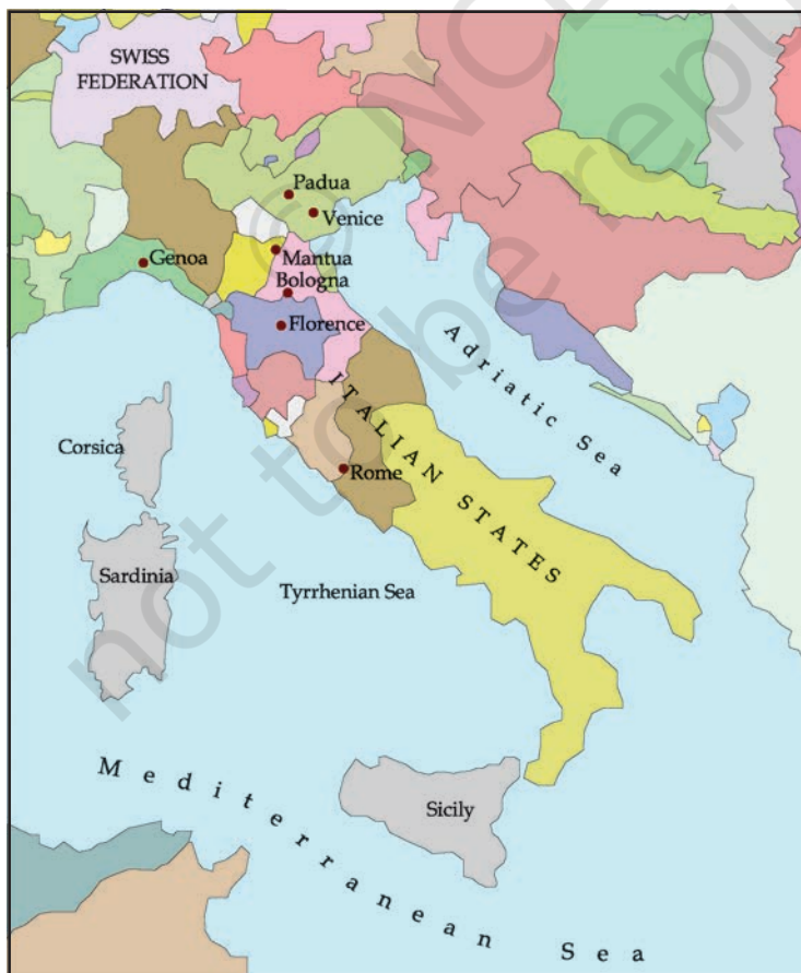
MAP 1: The Italian States

With the expansion of trade between the Byzantine Empire and the Islamic countries, the ports on the Italian coast revived. From the twelfth century, as the Mongols opened up trade with China via the Silk Route (see Theme 5) and as trade with western European countries