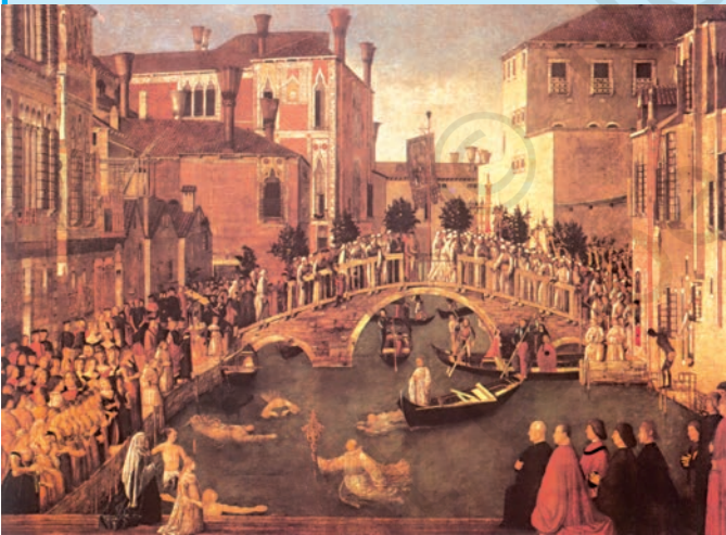
G. Bellini's 'The Recovery of the Relic of the Holy Cross' was painted in 1500, to recall an event of 1370, and is set in fifteenth-century Venice.

Now first I am to yield you a reckoning how and with what wisdom it was ordained by our ancestors, that the common people should not be admitted into