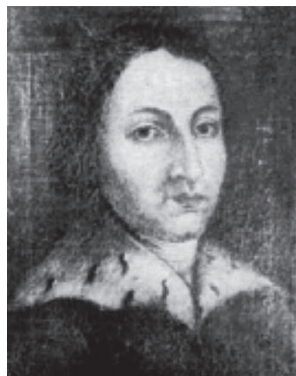
Self-portrait by Copernicus.

Celestial means divine or heavenly, while terrestrial implies having a worldly quality.