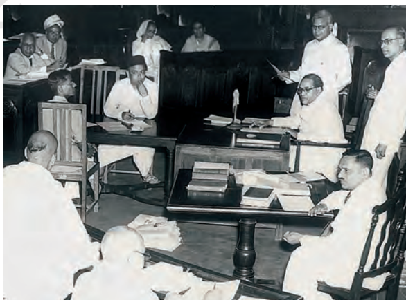
Dr. B.R. Ambedkar presiding over a discussion in the Constituent Assembly

Dr. B.R. Ambedkar CAD, Vol. VII, p.37, 4 November 1948