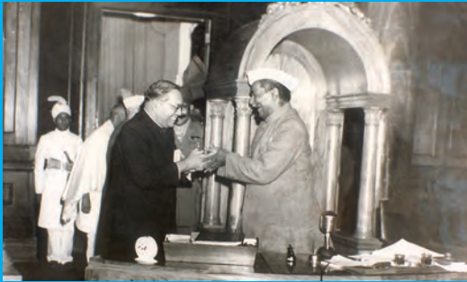
The President of the Constituent Assembly, Dr. Rajendra Prasad and the Chairman of the Drafting Committee, Dr. B.R. Ambedkar greeting each other

Constituent Assembly, where each clause of the Constitution was subjected to scrutiny and debate, is a tribute to public reason at its best. These debates deserved to be memorialised as one of the most significant chapters in the history of constitution making, equal in importance to the French and American revolutions.