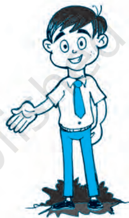
This group is very much like the people of my village.

for all their diversity, this group has to live together. They are dependent upon each other in various ways. They require the cooperation of each other. What will enable the group to live together peacefully?