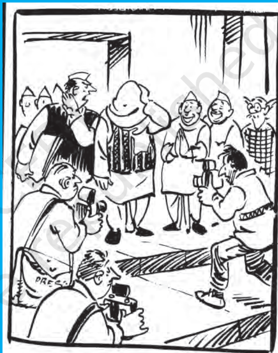
Forget that old habit and face the camera! Remember you have been nominated and are standing for the election now!

Should a person accused of a serious crime be barred from contesting elections?