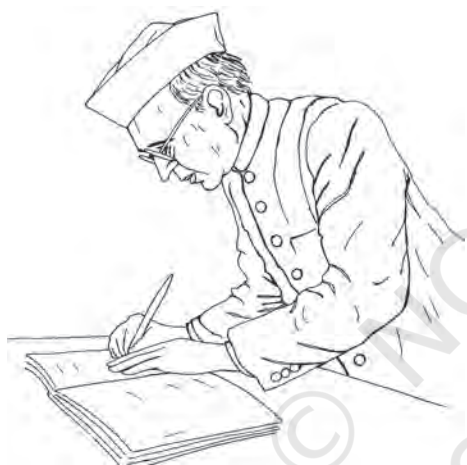
Jawaharlal Nehru CAD, Vol. VI, p. 734

We have already seen that President is the formal head of the government. In this formal sense, the President has wide ranging executive, legislative, judicial and emergency powers. In a parliamentary system, these powers are in reality used by the President only on the advice of the Council of Ministers. The Prime Minister and the Council of Ministers have support of the majority in the Lok Sabha and they are the real executive. In most of the cases, the President has to follow the advice of the Council of Ministers.