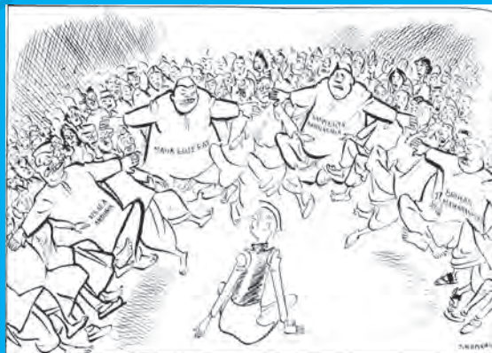
26 July 1953

Flood of demands for creating new States