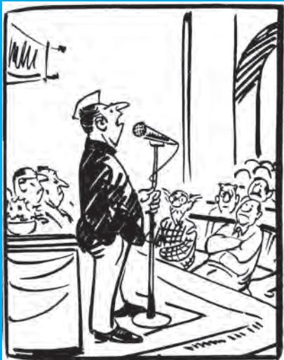
It is a malicious lie to say we topple non-Congress governments. We topple our own too like UP, Sikkim - maybe later Bihar, MP etc.

Toppling the State governments. Everyone loves to play this game!