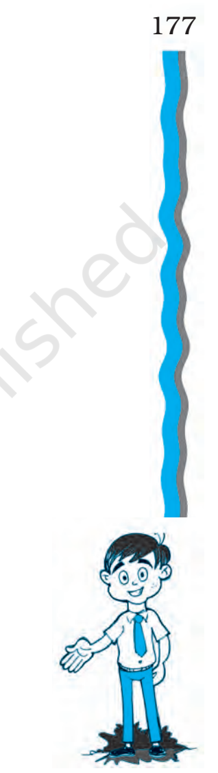
But aren't there cases of male members of the village panchayat harassing the woman Sarpanch in some places? Why are men not happy when women assume positions of responsibility?

Both these stories are not isolated incidents. They are representative of a larger transformation that is taking place across India especially after constitutional status was accorded to local government institutions in 1993.