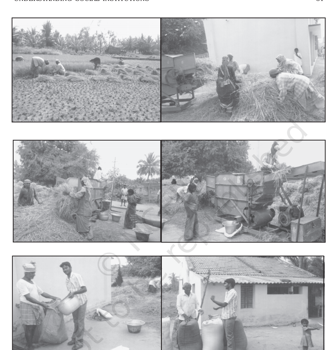
Threshing of paddy in a village