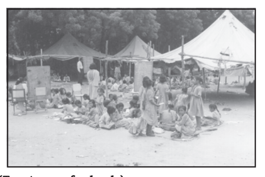
Discuss the visuals (Two types of schools)

For the sociologists who perceive society as unequally differentiated, education functions as a main