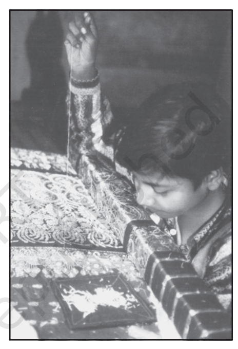
Discuss the visual

The report indicates how gender and caste discrimination impinge upon the chances of education. Recall how we began this book in Chapter 1 about a child's chances for a good job