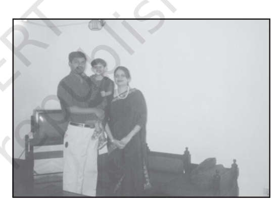
Notice how families and residences are different