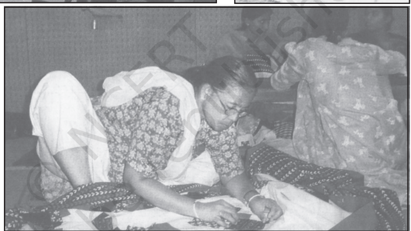
Different Types of Work

physical effort, which has as its objective the production of goods and services that cater to human needs.