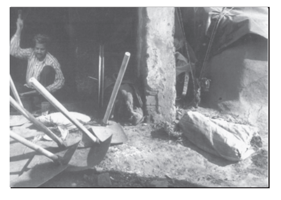
Work and Home