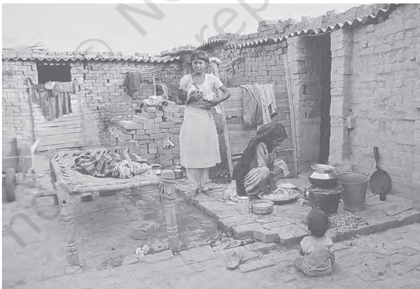
A girl child looking after the sibling

the emergence of slums. Though official definitions vary, a slum is a congested, overcrowded neighbourhood with no proper civic facilities (sanitation, water supply, electricity and so on) and homes made of all kinds of building materials ranging from plastic sheets and cardboard to multi-storeyed concrete structures. Because of the absence of 'settled' property rights of the kind seen elsewhere, slums are the natural breeding ground for 'dadas' and strongmen who impose their authority on the people who live there. Control over slum territory becomes the natural stepping stone to other kinds of extra-legal activities, including criminal and real estate-related gangs.