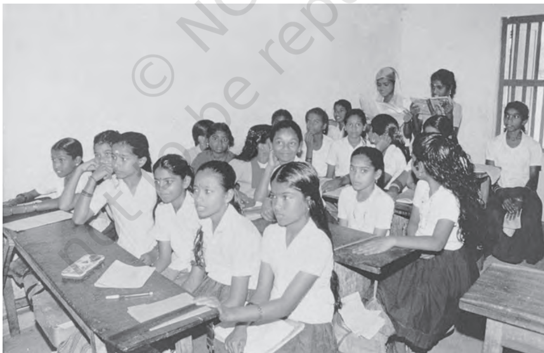
Students in a classroom

But by far the most common way of classifying social change is by its causes or sources. Sometimes the causes are pre-classified into internal (or endogenous) and external (or exogenous) causes. There are five broad types of sources or causes of social change: environmental, technological, economic, political and cultural.