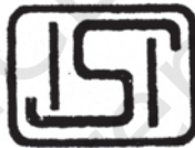
Mark of Bureau of Indian Standards