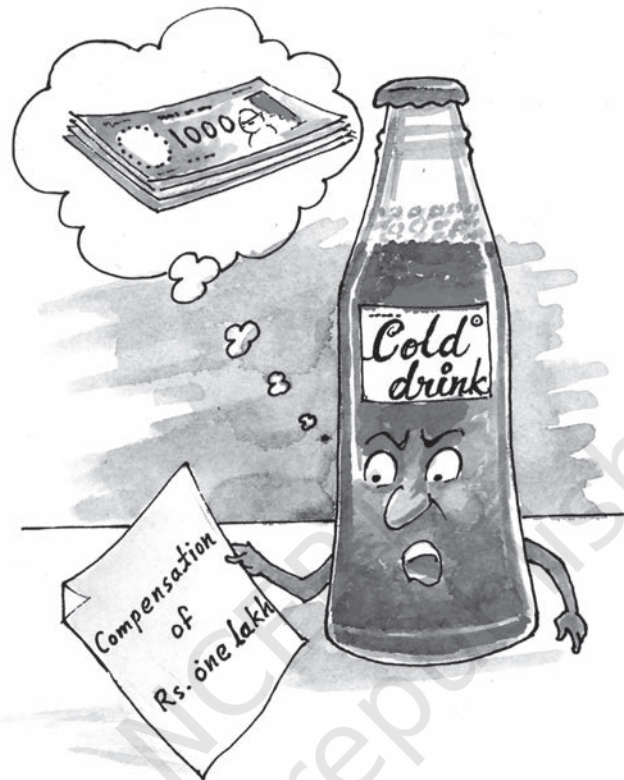
Compensation for impurities in cold drinks