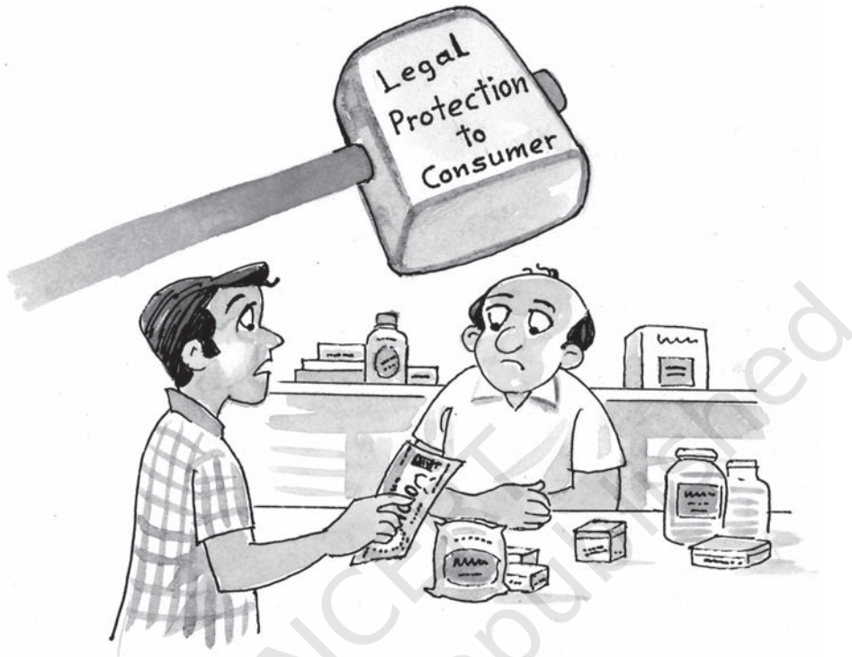
Protection against malpractices and exploitation

services for resale or commercial purpose is not treated as a consumer and is outside the scope of Consumer Protection Act 2019.