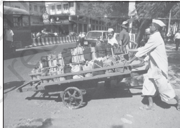
Fig. 6.4: Dabbawala Service in Mumbai

Personal services are made available to the people to facilitate their work in daily life. The workers migrate from rural areas in search of employment and are unskilled. They are employed in domestic services as housekeepers, cooks, and gardeners. This segment of workers is generally unorganised. One such example in India is Mumbai's dabbawala (Tiffin) service provided to about 1,75,000 customers all over the city.