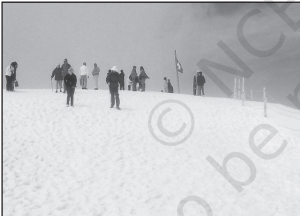
Fig. 6.5: Tourists skiing in the snow capped mountain slopes of Switzerland

Tourism is travel undertaken for purposes of recreation rather than business. It has become the world's single largest tertiary activity in total registered jobs (250 million) and total revenue (40 per cent of the total GDP). Besides, many local persons, are employed to provide services like accommodation, meals, transport, entertainment and special shops serving the tourists. Tourism fosters the growth of infrastructure industries, retail trading, and craft industries (souvenirs). In some regions, tourism is seasonal because the vacation period is dependent on favourable weather conditions, but many regions attract visitors all the year round.