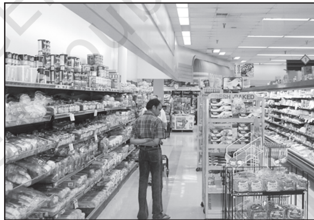
Fig. 6.3: Packed Food Market in U.S.A.

Urban marketing centres have more widely specialised urban services. They provide ordinary goods and services as well as many of the specialised goods and services required by people. Urban centres, therefore, offer manufactured goods as well as many specialised markets develop, e.g. markets for labour, housing, semi or finished products. Services of educational institutions and professionals such as teachers, lawyers, consultants, physicians, dentists and veterinary doctors are available.