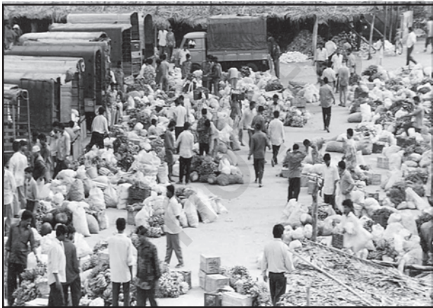
Fig. 6.2: A Wholesale Vegetable Market

Rural marketing centres cater to nearby settlements. These are quasi-urban centres. They serve as trading centres of the most rudimentary type. Here personal and professional services are not well-developed. These form local collecting and distributing centres. Most of these have mandis (wholesale markets) and also retailing areas. They are not urban centres per se but are significant centres for making available goods and services which are most frequently demanded by rural folk.