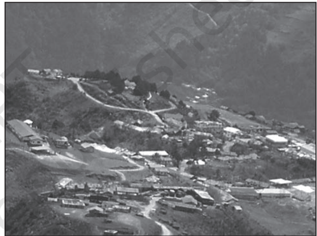
Fig. 2.2 : Semi-clustered settlements

Semi-clustered or fragmented settlements may result from tendency of clustering in a restricted area of dispersed settlement. More often such a pattern may also result from segregation or fragmentation of a large compact village. In this case, one or more sections of the village society choose or is forced to live a little away from the main cluster or village. In such cases, generally, the land-owning and dominant community occupies the central part of the main village, whereas people of lower strata of society and menial workers settle on the outer flanks of the village. Such settlements are widespread in the Gujarat plain and some parts of Rajasthan.