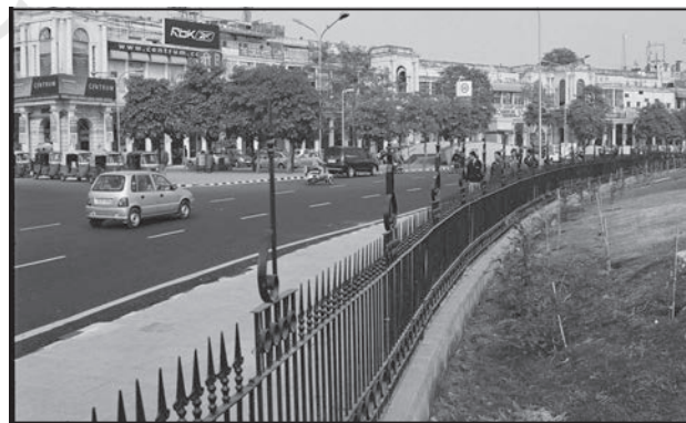
Fig. 2.4 : A view of the modern city

The British and other Europeans have developed a number of towns in India. Starting their foothold on coastal locations, they first developed some trading ports such as Surat, Daman, Goa, Pondicherry, etc. The British later consolidated their hold around three principal nodes – Mumbai (Bombay), Chennai (Madras), and Kolkata (Calcutta) – and built them in the British style. Rapidly