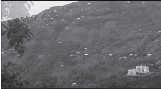
Fig. 2.3 : Dispersed settlements in Nagaland

with farms or pasture on the slopes. Extreme dispersion of settlement is often caused by extremely fragmented nature of the terrain and land resource base of habitable areas. Many areas of Meghalaya, Uttarakhand, Himachal Pradesh and Kerala have this type of settlement.