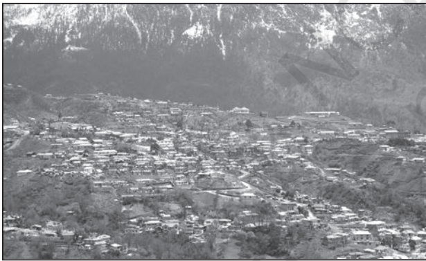
Fig. 2.1 : Clustered Settlements in the North-eastern states

The clustered rural settlement is a compact or closely built up area of houses. In this type of village the general living area is distinct and separated from the surrounding farms, barns and pastures. The closely built-up area and its