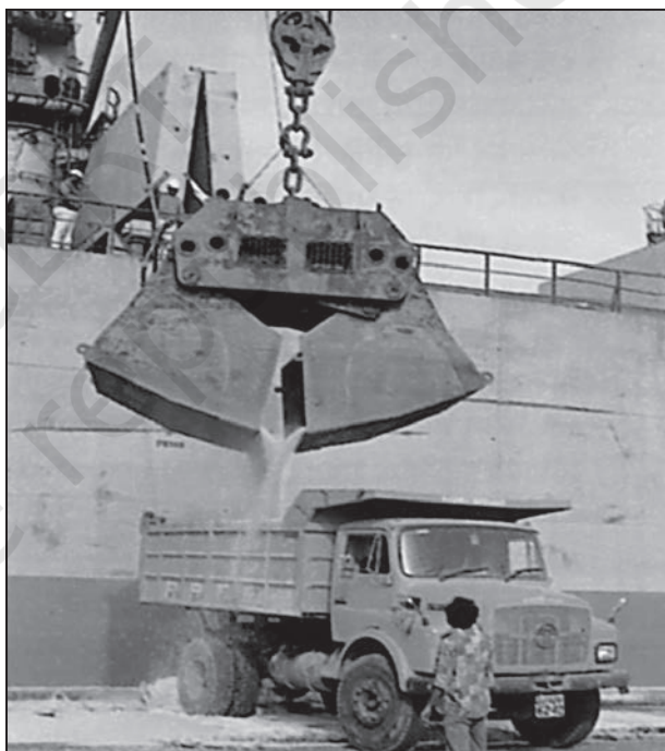
Fig. 8.3 : Unloading of goods on port

India is surrounded by sea from three sides and is bestowed with a long coastline. Water provides a smooth surface for very cheap transport provided there is no turbulence. India