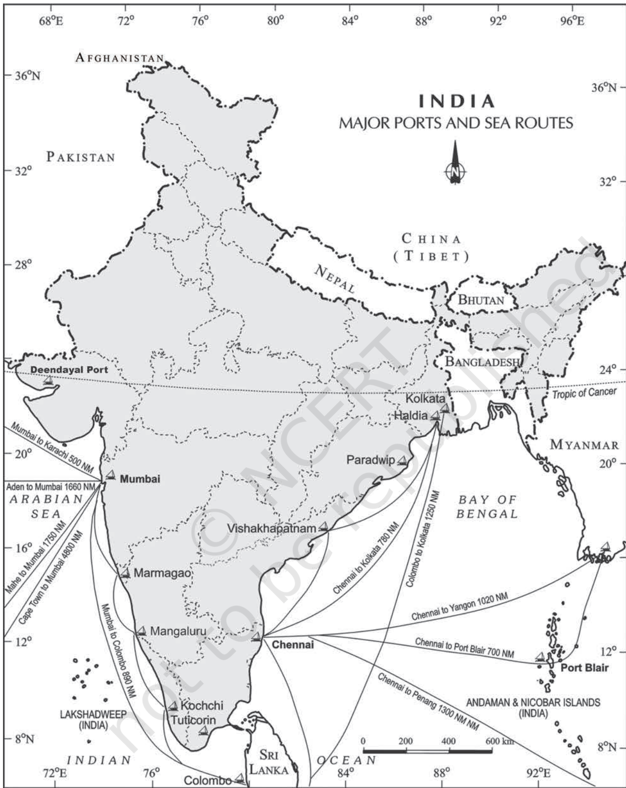
Fig. 8.4 : India - Major Ports and Sea Routes