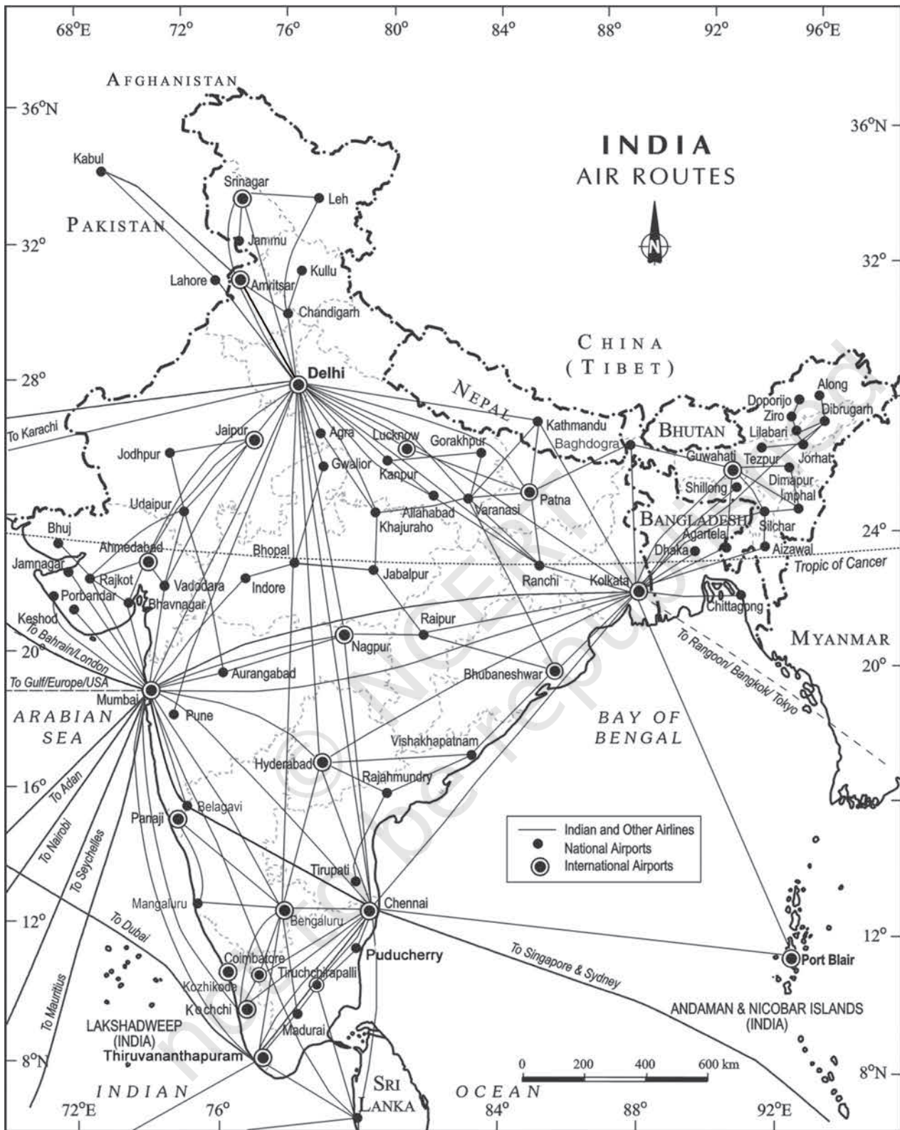
Fig. 8.5 : India - Air Routes