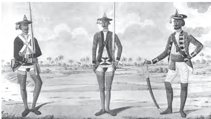
Fig. 10.7 Bengal sepoy in European-style uniform