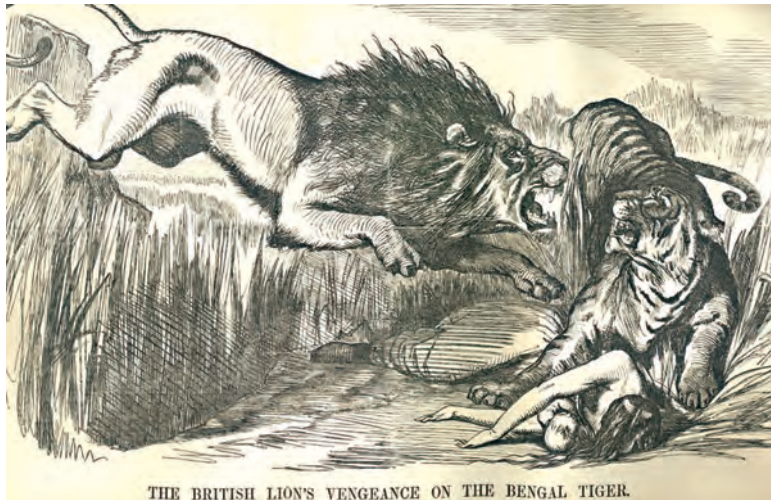
Fig. 10.14 The caption at the bottom reads “The British Lion’s Vengeance on the Bengal Tiger”, Punch , 1857.

➤ What idea is the picture projecting? What is being expressed through the images of the lion and the tiger? What do the figures of the woman and the child depict?