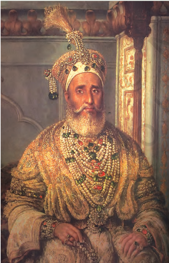
Fig. 10.1 Portrait of Bahadur Shah

Late in the afternoon of 10 May 1857, the sepoys in the cantonment of Meerut broke out in mutiny. It began in the lines of the native infantry, spread very swiftly to the cavalry and then to the city. The ordinary people of the town and surrounding villages joined the sepoys. The sepoys captured the bell of arms where the arms and ammunition were kept and proceeded to attack white people, and to ransack and burn their bungalows and property. Government buildings – the record office, jail, court, post office, treasury, etc. – were destroyed and plundered. The telegraph line to Delhi was cut. As darkness descended, a group of sepoys rode off towards Delhi.