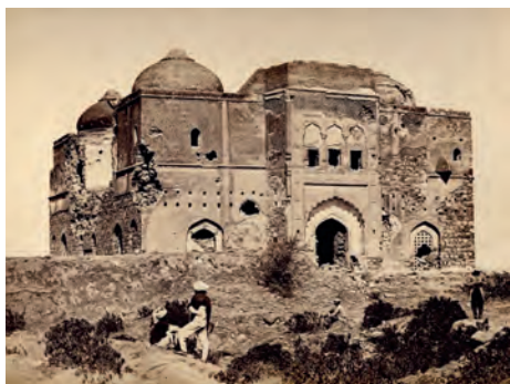
Fig. 10.8 A mosque on the Delhi Ridge, photograph by Felice Beato, 1857-58 After 1857, British photographers recorded innumerable images of desolation and ruin.

attempts to recover Delhi began in earnest in early June 1857 but it was only in late September that the city was finally captured. The fighting and losses on both sides were heavy. One reason for this was the fact that rebels from all over North India had come to Delhi to defend the capital.