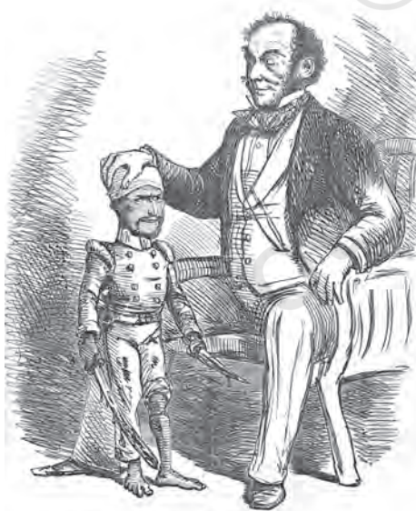
THE CLEMENCY OF CANNING.

In one of the cartoons published in the pages of Punch , a British journal of comic satire, Canning is shown as a looming father figure, with his protective hand over the head of a sepoy who still holds an unsheathed sword in one hand and a dagger in the other, both dripping with blood (Fig.10.17) – an imagery that recurs in a number of British pictures of the time.