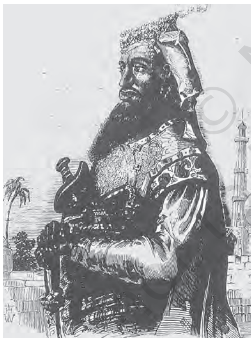
Fig. 10.4 Nana Sahib At the end of 1858, when the rebellion collapsed, Nana Sahib escaped to Nepal. The story of his escape added to the legend of Nana Sahib's courage and valour.