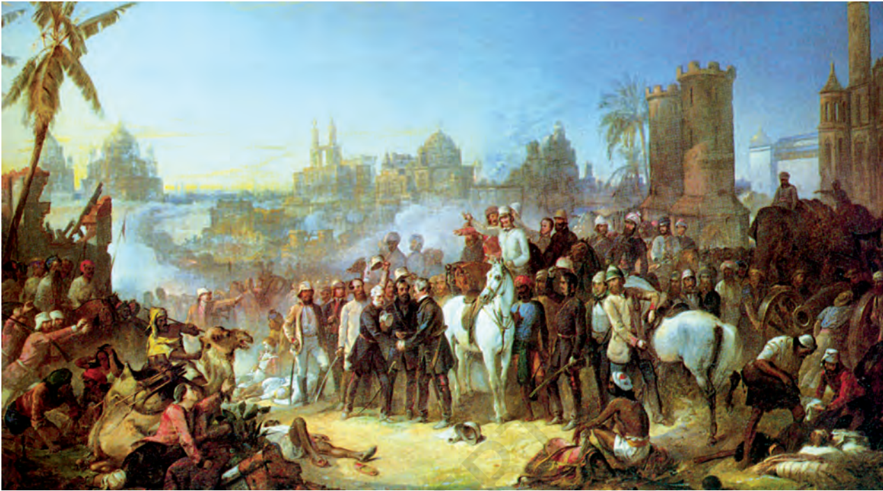
Fig. 10.10 "Relief of Lucknow", painted by Thomas Jones Barker, 1859

was appointed as the new Commander of British forces in India, came with his forces and rescued the besieged British garrison. In British accounts the siege of Lucknow became a story of survival, heroic resistance and the ultimate triumph of British power.