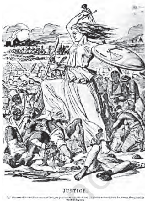
Fig. 10.13 Justice , Punch, 12 September 1857 The caption at the bottom reads “The news of the terrible massacre at Cawnpore (Kanpur) produced an outburst of fiery indignation and wild desire for revenge throughout the whole of England.”

In another set of sketches and paintings we see women in a different light. They appear heroic, defending themselves against the attack of rebels. Miss Wheeler in Figure 10.12 stands firmly at the centre, defending her honour, single-handedly killing the attacking rebels. As in all such British representations, the rebels are demonised. Here, four burly males with swords and guns are shown attacking a woman. The woman's struggle to save her honour and her life, in fact, is represented as having a deeper religious connotation: it is a battle to save the honour of Christianity. The book lying on the floor is the Bible.