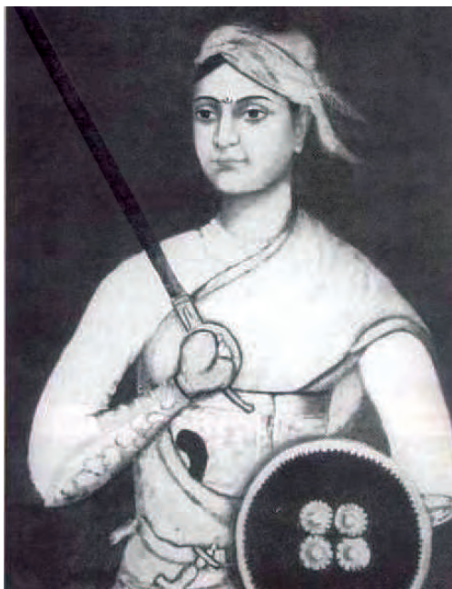
Fig. 10.3 Rani Lakshmi Bai, a popular image