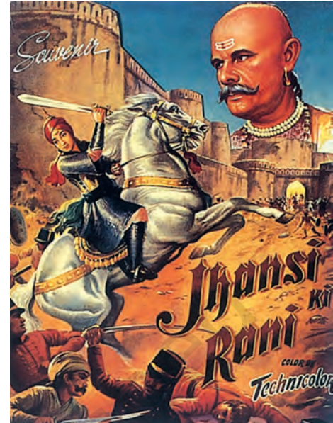
Fig. 10.18 Films and posters have helped create the image of Rani Lakshmi Bai as a masculine warrior

These images did not only reflect the emotions and feelings of the times in which they were produced. They also shaped sensibilities. Fed by the images that circulated in Britain, the public sanctioned the most brutal forms of repression of the rebels. On the other hand, nationalist imageries of the revolt helped shape the nationalist imagination.