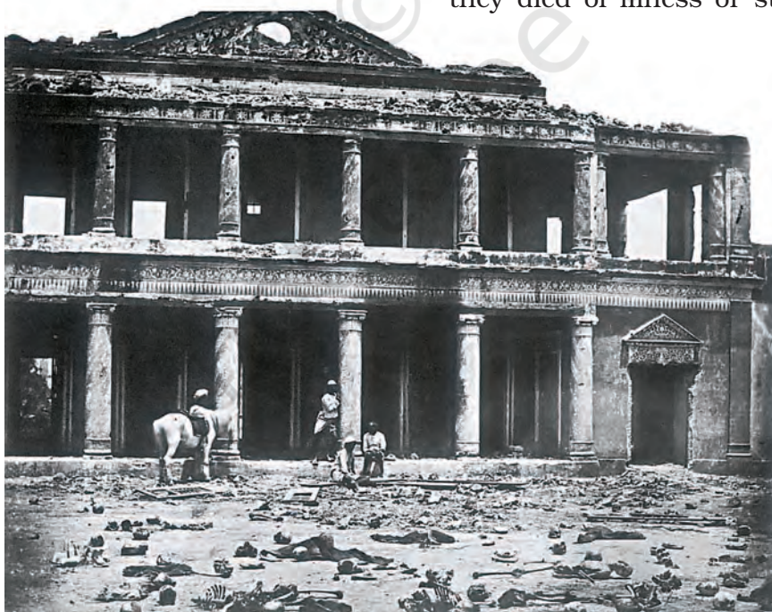
Fig. 10.9 Secundrah Bagh, Lucknow, photograph by Felice Beato, 1858

The British used military power on a gigantic scale. But this was not the only instrument they used. In large parts of present-day Uttar Pradesh, where big landholders and peasants had offered united resistance, the British tried to break up the unity by promising to give back to the big landholders their estates. Rebel landholders were dispossessed and the loyal rewarded. Many landholders died fighting the British or they escaped into Nepal where they died of illness or starvation.