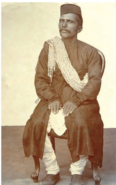
Fig. 10.6 A zamindar from Awadh, 1880

and issues, traditions and loyalties worked themselves out in the revolt of 1857. In Awadh, more than anywhere else, the revolt became an expression of popular resistance to an alien order.