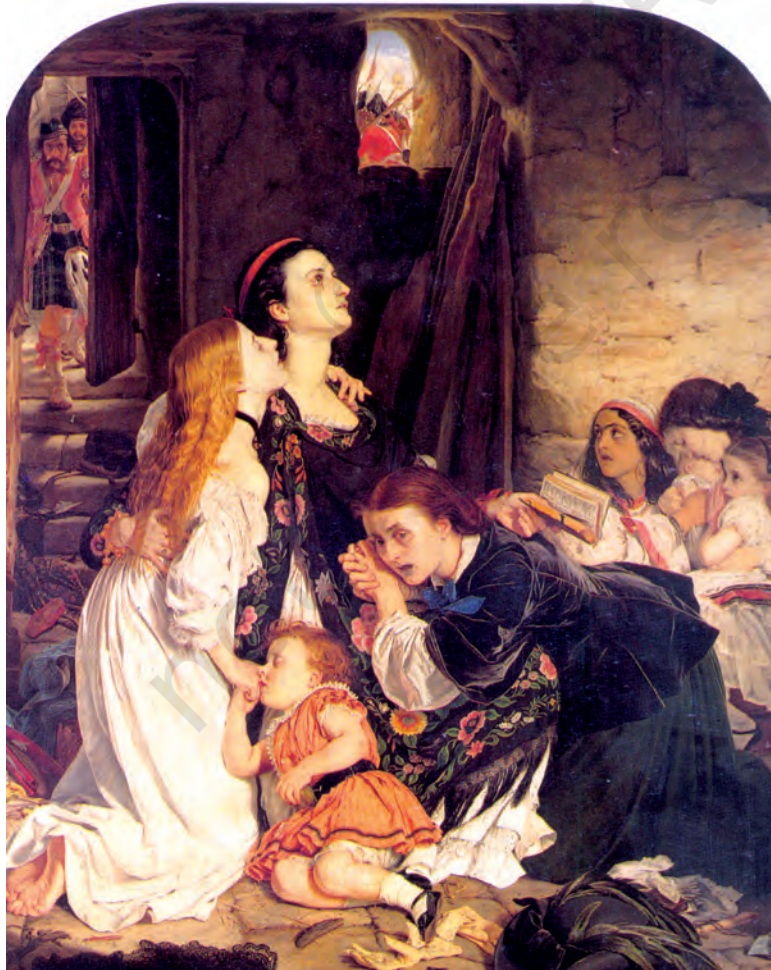
Fig. 10.11 "In Memoriam", by Joseph Noel Paton, 1859

"In Memoriam" (Fig. 10.11) was painted by Joseph Noel Paton two years after the mutiny. You can see English women and children huddled in a circle, looking helpless and innocent, seemingly waiting for the inevitable – dishonour, violence and death. "In Memoriam" does not show gory violence; it only suggests it. It stirs up the spectator's imagination, and seeks to provoke anger and fury. It represents the rebels as violent and brutish, even though they remain invisible in the picture. In the background you can see the British rescue forces arriving as saviours.