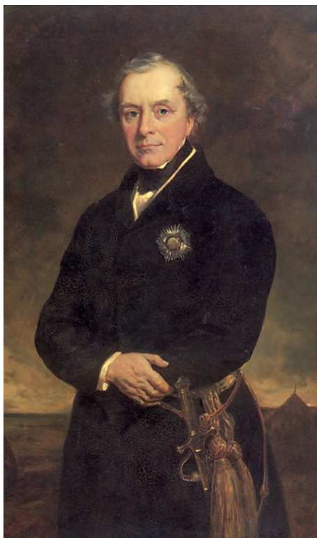
Fig. 10.5 Henry Hardinge, by Francis Grant, 1849

As Governor General, Hardinge attempted to modernise the equipment of the army. The Enfield rifles that were introduced initially used the greased cartridges the sepoys rebelled against.