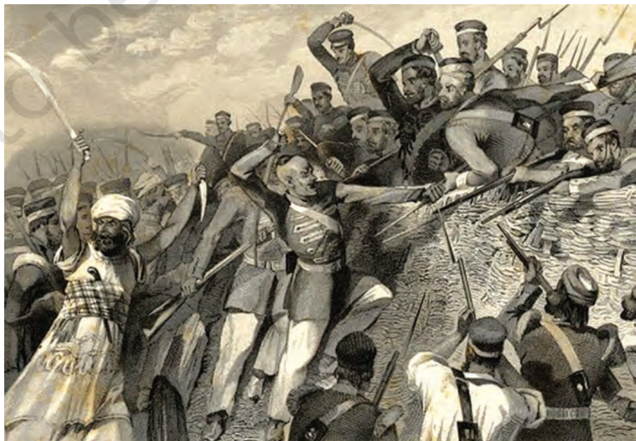
Fig. 10.2 Ordinary people join the sepoys in attacking the British in Lucknow.

Firangi , a term of Persian origin, possibly derived from Frank (from which France gets its name), is used in Urdu and Hindi, often in a derogatory sense, to designate foreigners.