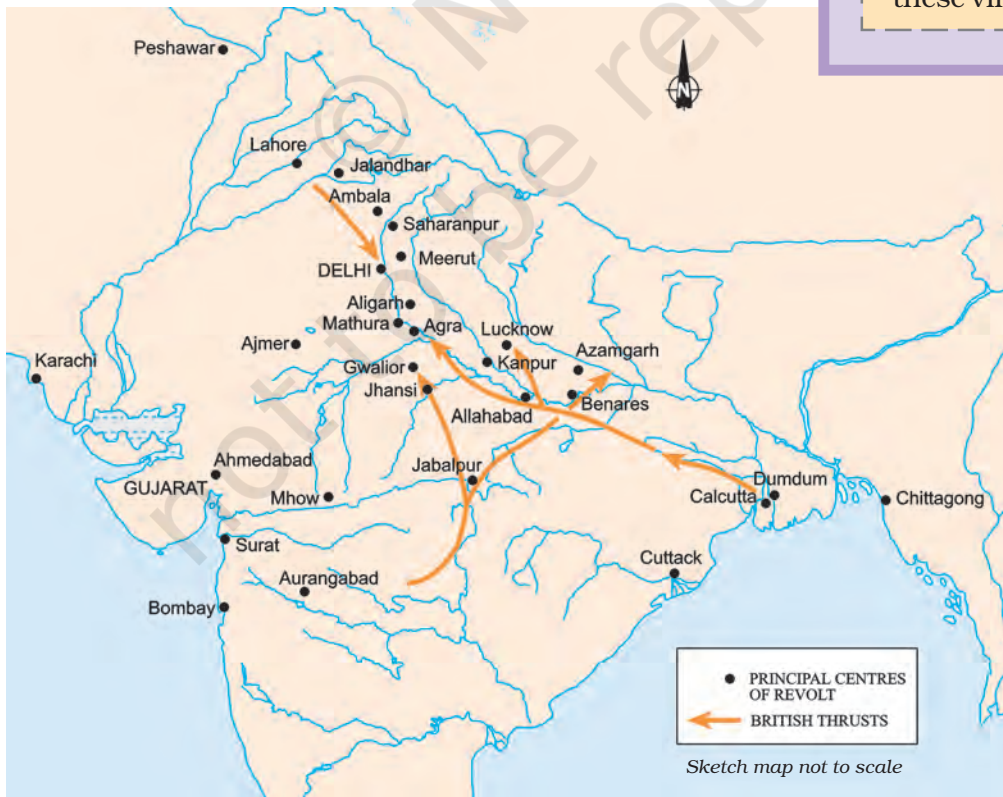
Map 2 The map shows the important centres of revolt and the lines of British attack against the rebels.

➔ What, according to this account, were the problems faced by the British in dealing with these villagers?