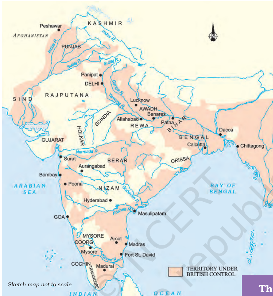
Map 1 Territories under British control in 1857