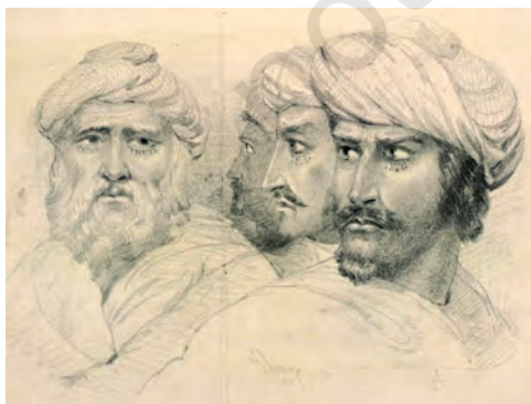
Fig. 10.19 Faces of rebels