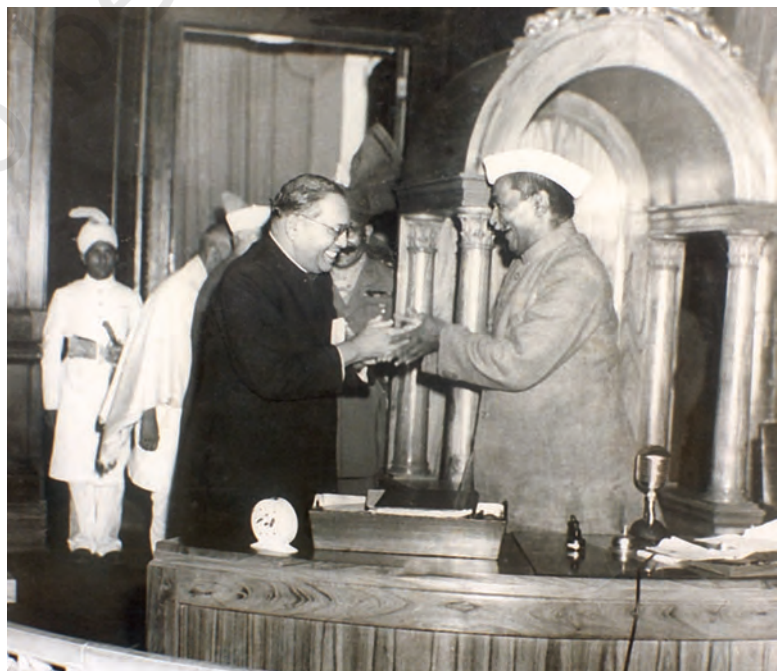
Fig. 12. 9 B. R. Ambedkar and Rajendra Prasad greeting each other at the time of the handing over of the Constitution

The Constituent Assembly debates help us understand the many conflicting voices that had to be negotiated in framing the Constitution, and the many demands that were articulated. They tell us about the ideals that were invoked and the principles that the makers of the Constitution operated with. But in reading these debates we need to be aware that the ideals invoked were very often re-worked according to what seemed appropriate within a context. At times the members of the Assembly also changed their ideas as the debate unfolded over three years. Hearing others argue, some members rethought their positions, opening their minds to contrary views, while others changed their views in reaction to the events around.