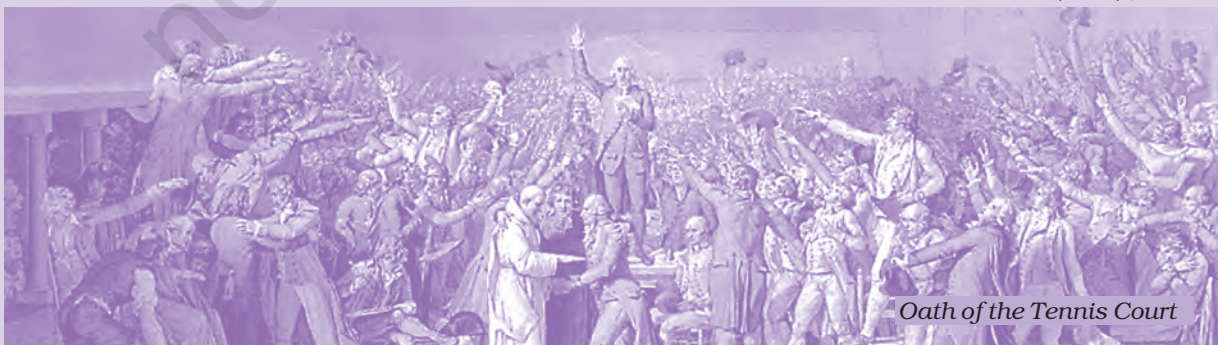
Oath of the Tennis Court

CONSTITUENT ASSEMBLY DEBATES (CAD), VOL. I