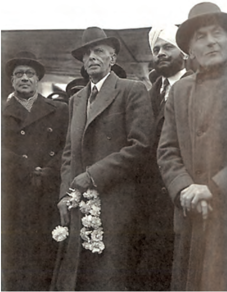
Fig. 12.8 In the winter of 1946 Indian leaders went to London for what turned out to be a fruitless round of talks with British Prime Minister Attlee. (Left to right: Liaquat Ali, Mohammad Ali Jinnah, Baldev Singh and Pethick-Lawrence)