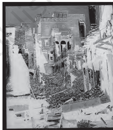
Fig. 12.2 Images of desolation and destruction continued to haunt members of the Constituent Assembly.

On Independence Day, 15 August 1947, there was an outburst of joy and hope, unforgettable for those who lived through that time. But innumerable Muslims in India, and Hindus and Sikhs in Pakistan, were now faced with a cruel choice – the threat of