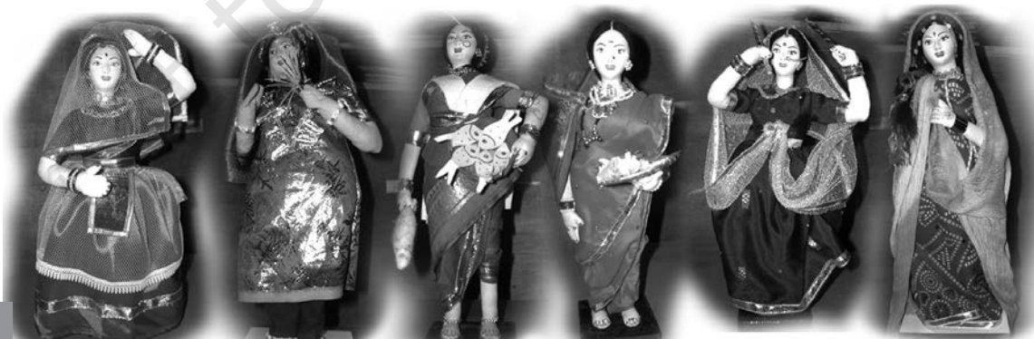
Left Margin: Food from different parts of India; Right top: Child dressed in Kashmiri Clothes; Bottom: Dolls dressed in costumes of different Indian States.

The notion of minority groups is widely used in sociology and is more than a merely numerical distinction – it usually involves some sense of relative disadvantage. Thus, privileged minorities such as extremely wealthy people are not usually referred to as minorities; if they are, the term is qualified in some way, as in the phrase ‘privileged minority’. When minority is used without qualification, it generally implies a relatively small but also disadvantaged group. The sociological sense of minority also implies that the members of the minority form a collectivity – that is, they have a strong sense of group solidarity, a feeling of togetherness and belonging. This is linked to disadvantage because the experience of being subjected to prejudice and discrimination usually heightens feelings of intra-group loyalty and interests (Giddens 2001:248). Thus, groups that may be minorities in a statistical sense, such as people who are left-handed or people born on 29 th February, are not minorities in the sociological sense because they do not form a collectivity.