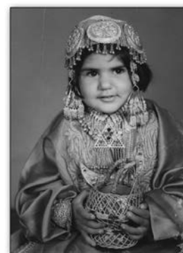
A Kashmiri girl

To be effective, the ideas of inclusive nationalism had to be built into the Constitution. For, as already discussed (in section 6.1), there is a very strong tendency for the dominant group to assume that their culture, language or religion is synonymous with the nation state. However, for a strong and democratic nation, special constitutional provisions are required to ensure the rights of all groups and those of minority groups in particular. A brief discussion on the definition of minorities will enable us to appreciate the importance of safeguarding minority rights for a strong, united and democratic nation.