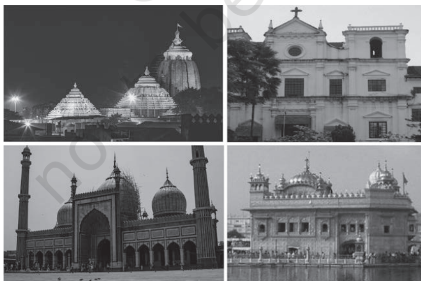
Images of different religious places

In everyday language, the word ' communalism ' refers to aggressive chauvinism based on religious identity. Chauvinism itself is an attitude that sees one's own group as the only legitimate or worthy group, with other groups being seen – by definition – as inferior, illegitimate and opposed. Thus, to simplify further, communalism is an aggressive political ideology linked to religion. This is a peculiarly Indian, or perhaps South Asian, meaning that is different from the sense of the ordinary English word. In the English language, "communal" means something related to a community or collectivity as different from an individual. The English meaning is neutral, whereas the South Asian meaning is strongly charged. The charge may be seen as positive – if one is sympathetic to communalism – or negative, if one is opposed to it.