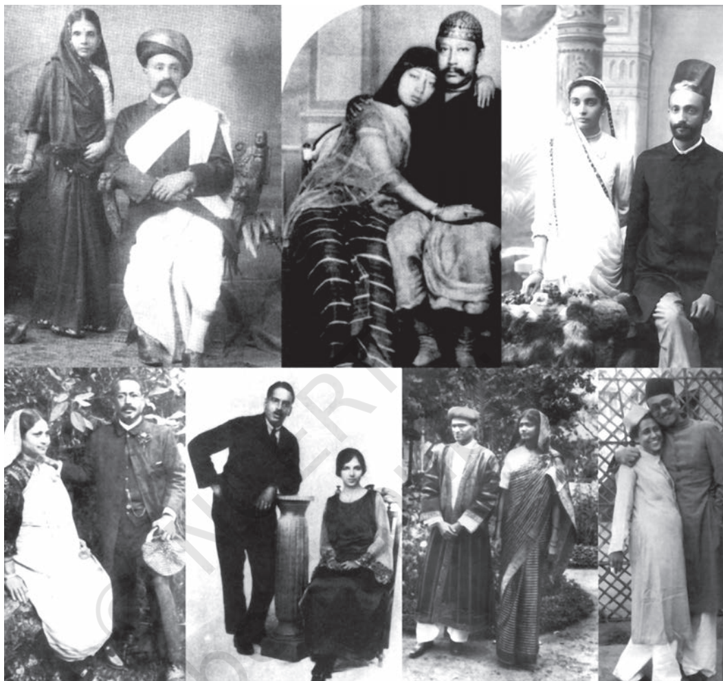
Couples from different regions 1880s to 1930s: Clockwise from top left corner: Gujarat; Tripura; Bombay; Aligarh; Hyderabad; Goa; Calcutta. From Malavika Karlekar, Visualising Indian Women 1875–1947 , Oxford University Press, New Delhi.

Note: In this chapter, the word “State” has a capital S when it is used to denote the federal units within the Indian nation-state; the lower case ‘state’ is used for the broader conceptual category.