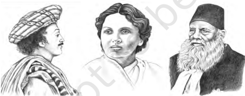
Raja Ram Mohun Roy Pandita Ramabai Sir Syed Ahmed Khan

You have already seen the far-reaching impact of colonialism on our lives. The social reform movements which emerged in India in the 19 th century arose to the challenges that colonial Indian society faced. You probably are familiar with what were termed social evils that plagued Indian society. The well-known issues are that of sati , child marriage, ban on widow remarriage and