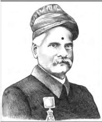
Raja Ravi Varma

You can see the many diverse levels that cultural change, resulting from our colonial encounter with the west, took place. In the contemporary context often conflicts between generations are seen as cultural conflicts resulting from westernisation. Have you seen this or faced this? Is Westernisation the only reason for generational conflicts? Are conflicts necessarily bad?