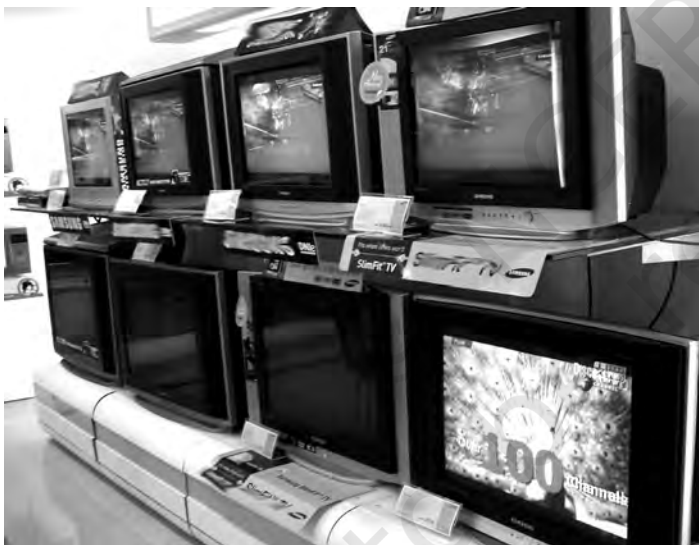
A television showroom