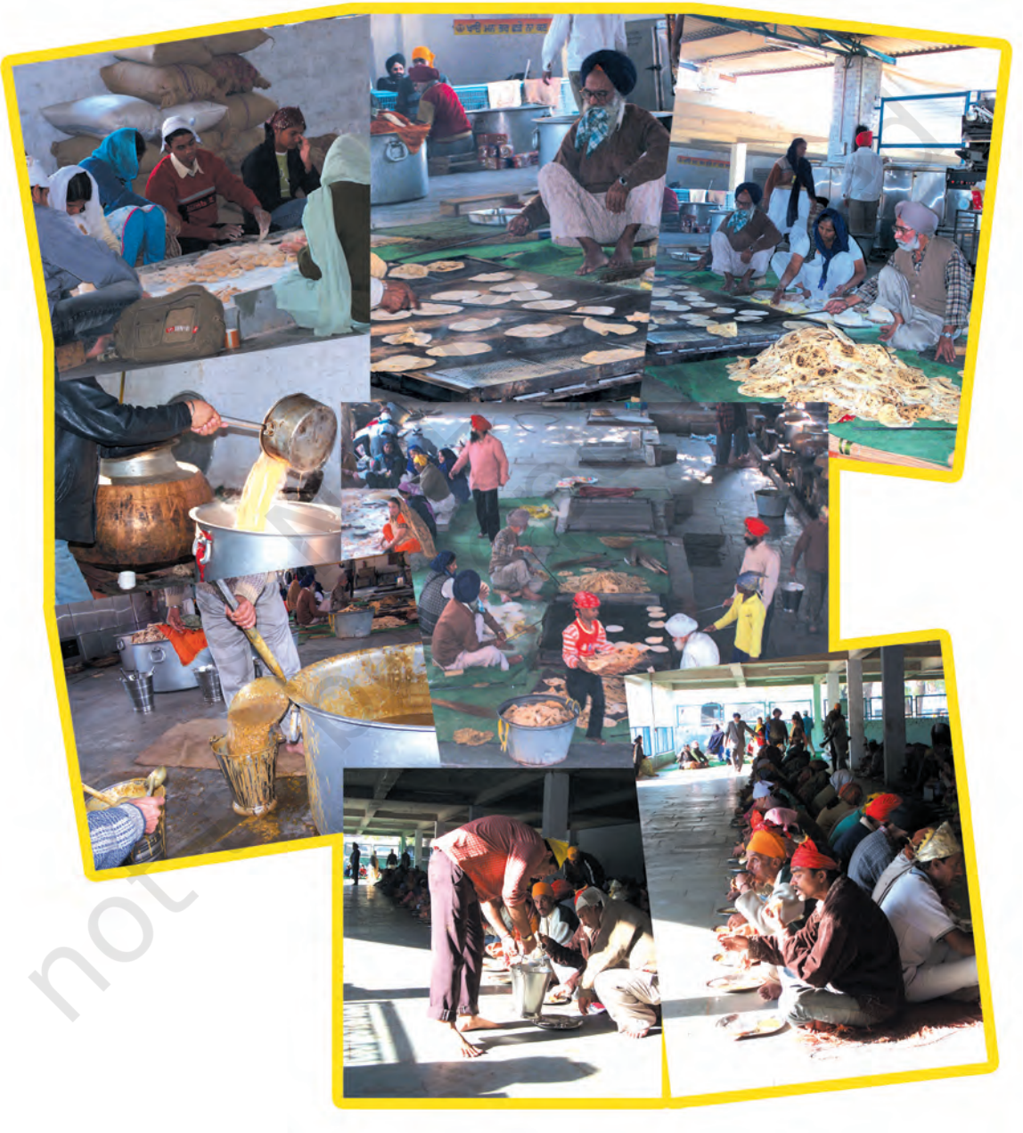
Different scenes from a Gurudwara langar