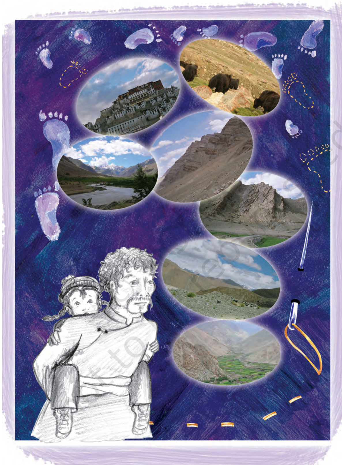
Chuskit amongst photographs from Ladakh