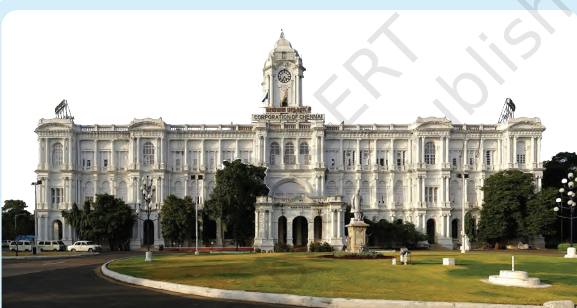
Fig. 12.3. The Madras Corporation

The Madras Corporation (now Greater Chennai Corporation), established on 29 September 1688, is the oldest municipal institution in India. The East India Company issued a charter the previous year constituting the town of 'Fort St. George' and all territories within 16 km from the Fort into a corporation. A Parliamentary Act of 1792 gave the Madras Corporation power to levy municipal taxes in the city, which is when the municipal administration properly began.