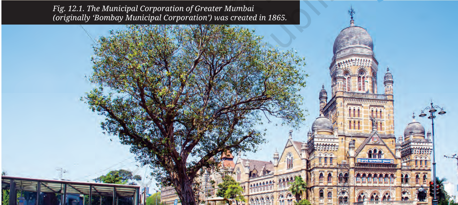
Fig. 12.1. The Municipal Corporation of Greater Mumbai (originally 'Bombay Municipal Corporation') was created in 1865.