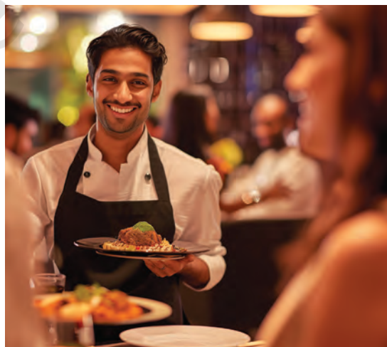
Services at restaurant