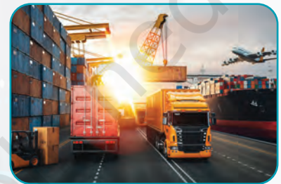
Trade and logistics