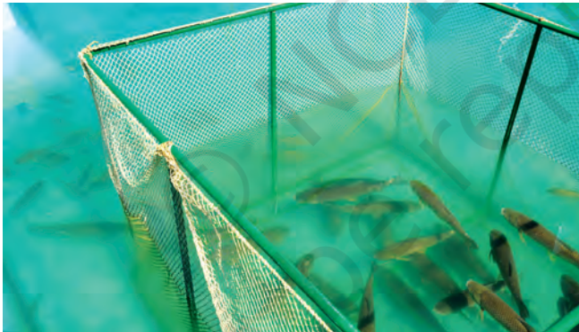
Fish farming (fishery)