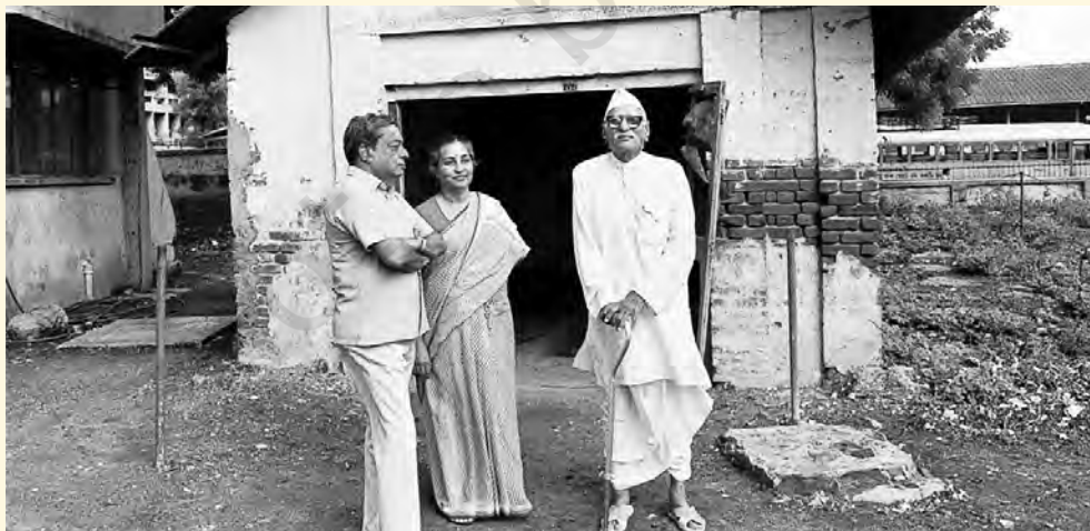
Varghese Kurien (left) and Tribhuvandas Patel (right)

Amul was set up in 1946 under the leadership of Tribhuvandas Patel (lawyer and freedom fighter) and Dr. Varghese Kurien (an engineer who was working at a dairy factory in Mumbai).