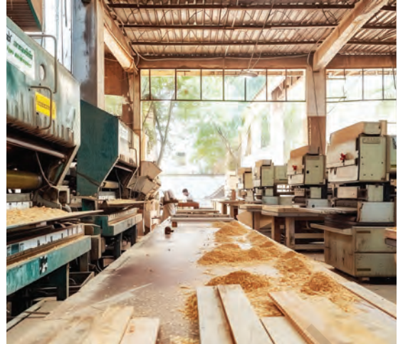
Furniture production unit