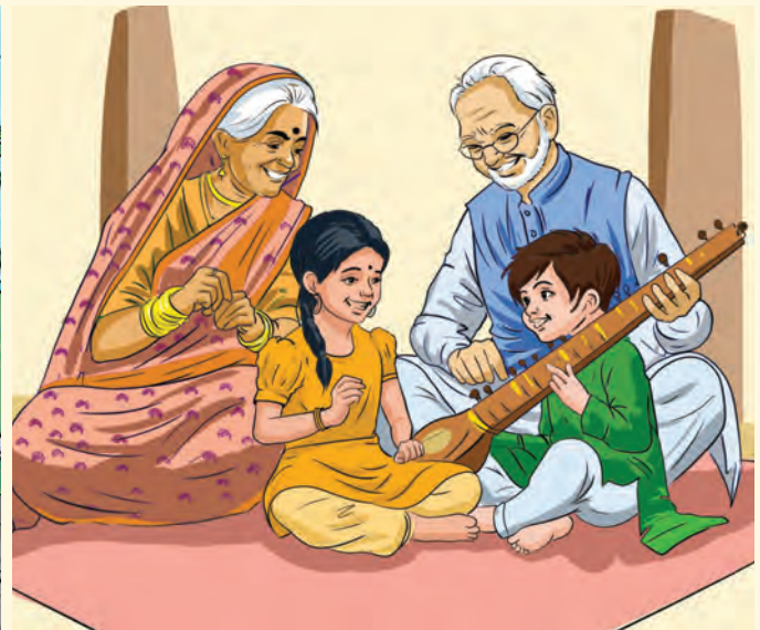
Examples of joint families