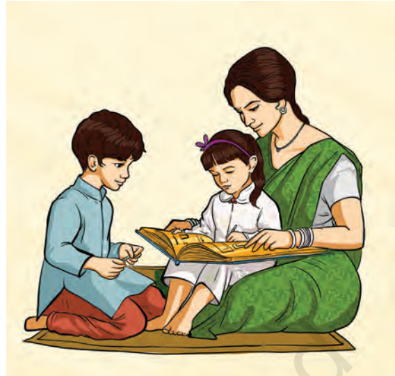
Examples of nuclear families

brothers, sisters and cousins. A nuclear family, on the other hand, is limited to a couple and their children, and sometimes one parent and children.