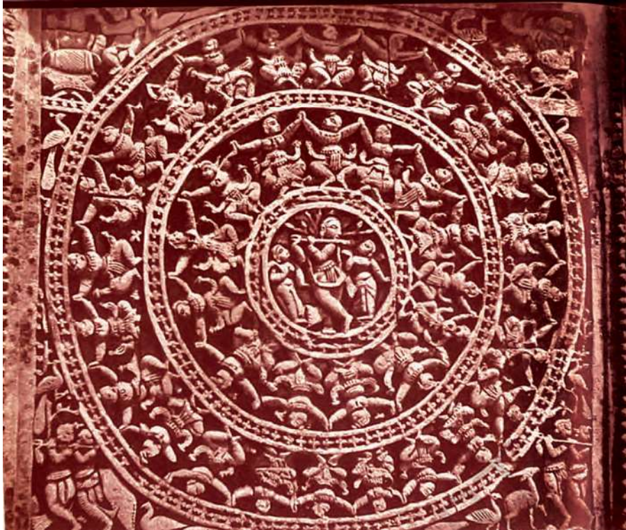
Fig. 13 Krishna with gopis, terracotta plaque from the Shyamaraya temple, Vishnupur.