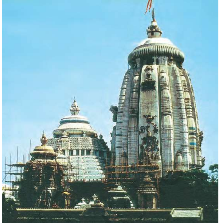
Fig. 3 Jagannatha temple, Puri.

These cultural traditions were closely linked with the ideals and aspirations of rulers. From about the eighth century, most of the present-day state of Rajasthan was ruled by various Rajput families. Prithviraj (Chapter 2) was one such ruler. These rulers cherished the ideal of the hero who fought valiantly, often choosing death on the battlefield rather than face defeat. Stories about Rajput heroes were recorded in poems and songs, which were recited by specially trained minstrels.