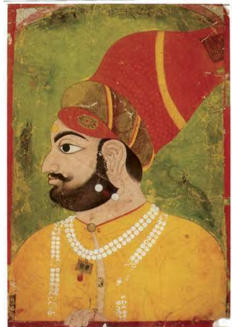
Fig. 4 Prince Raj Singh of Bikaner.