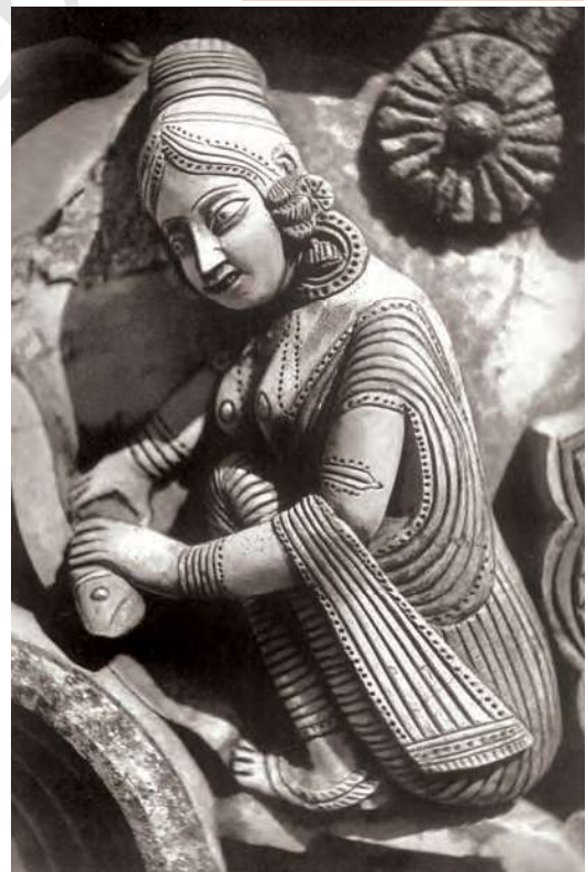
Fig. 14 Fish being dressed for domestic consumption, terracotta plaque from the Vishalakshi temple, Arambagh.

Brahmanas were not allowed to eat non-vegetarian food, but the popularity of fish in the local diet made the Brahmanical authorities relax this prohibition for the Bengal Brahmanas. The Brihaddharma Purana , a thirteenth-century Sanskrit text from Bengal, permitted the local Brahmanas to eat certain varieties of fish.