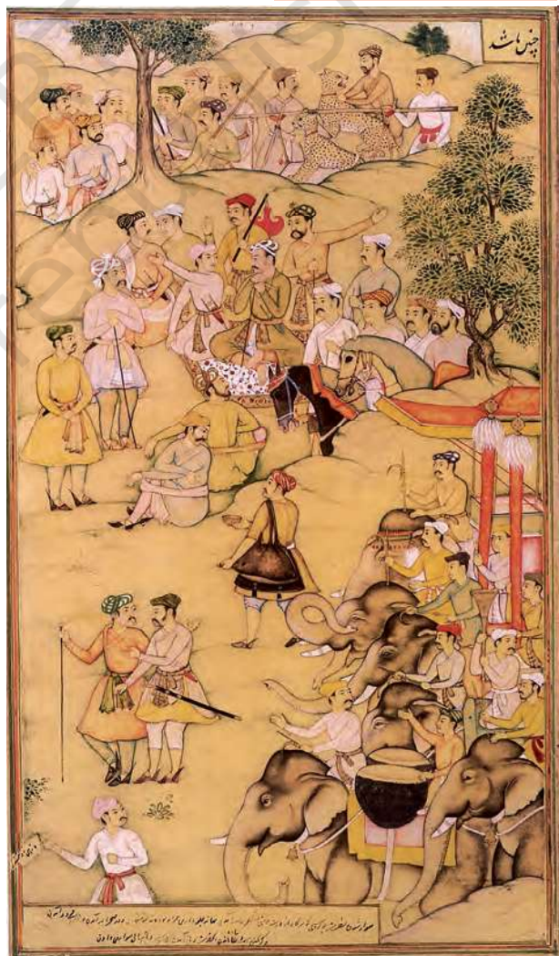
Fig. 7 Akbar resting during a hunt, Mughal miniature.

Another region that attracted miniature paintings was the Himalayan foothills around the modern-day state of Himachal Pradesh. By the late seventeenth