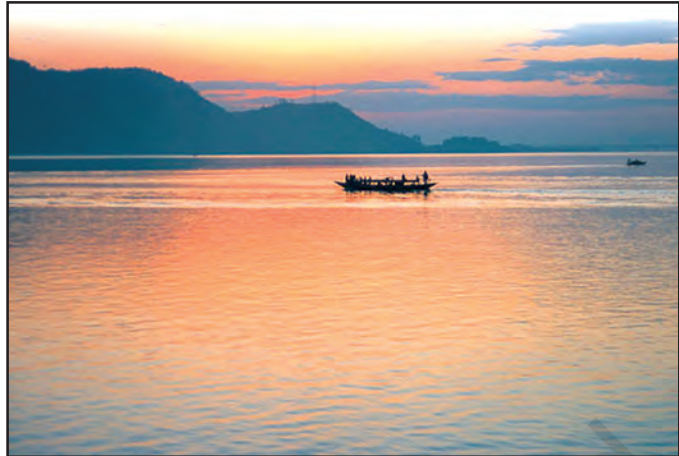
Fig. 6.7 Brahmaputra river

The tributaries of rivers Ganga and Brahmaputra together form the Ganga-Brahmaputra basin in the Indian subcontinent (Fig. 6.8). The basin lies in the sub-tropical region that is situated between 10°N to 30°N latitudes. The tributaries of the River Ganga like the Ghaghra, the Son, the Chambal, the Gandak, the Kosi and the tributaries of Brahmaputra drain it. Look at the atlas and find names of some tributaries of the River Brahmaputra.