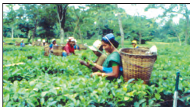
Fig. 6.10 : Tea Garden in Assam