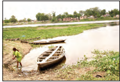
A Polluted Lake

to sell in the market. They have even begun supply to the neighbouring town. The community is living in harmony with nature. As long as the pollutants from nearby towns do not find their way into the lake waters, the fish cultivation will not face any threat.