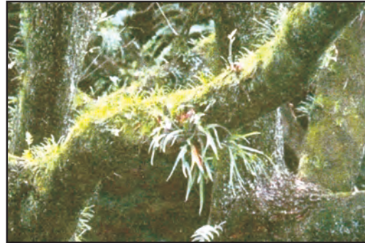
Fig. 6.3 : The Amazon Forest

As it rains heavily in this region, thick forests grow (Fig. 6.3). The forests are in fact so thick that the dense “roof” created by leaves and branches does not allow the sunlight to reach the ground. The ground remains dark and damp. Only shade tolerant vegetation may grow here. Orchids, bromeliads grow as plant parasites.