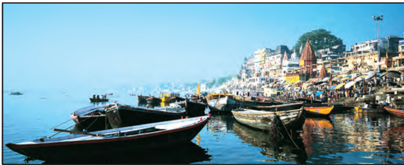
Fig. 6.13: Varanasi along the River Ganga

The Ganga-Brahmaputra plain has several big towns and cities. The cities of Allahabad, Kanpur, Varanasi, Lucknow, Patna and Kolkata all with the population of more than ten lakhs are located along the River Ganga (Fig. 6.13). The wastewater from these towns