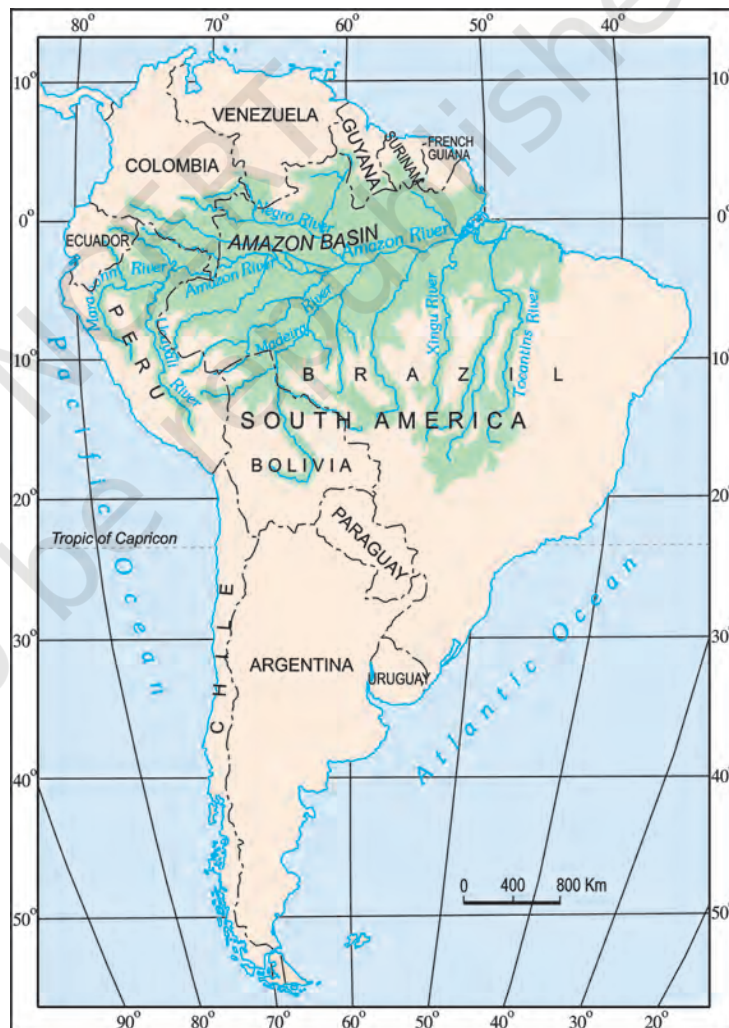
Fig. 6.2: The Amazon Basin in South America

Name the countries of the basin through which the equator passes.