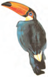
Fig. 6.4 : Toucans

The rainforest is rich in fauna. Birds such as toucans (Fig. 6.4), humming birds, macaw with their brilliantly coloured plumage, oversized bills for eating make them different from birds we commonly see in India. These birds also make loud sounds in the forests. Animals like monkeys, sloth and ant-eating tapirs are found here (Fig. 6.5). Various species of reptiles and snakes also thrive in these jungles. Crocodiles, snakes, pythons abound. Anaconda and boa constrictor are some of the species. Besides, the basin is home to thousands of species of insects. Several species of fishes including the flesh-eating Piranha fish is also found in the river. This basin is thus extraordinarily rich in the variety of life found there.