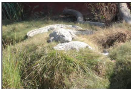
Fig. 6.12 : Crocodiles