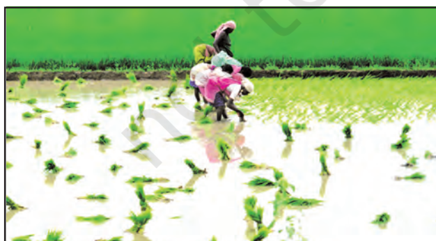
Fig. 6.9 : Paddy Cultivation

The vegetation cover of the area varies according to the type of landforms. In the Ganga and Brahmaputra plain tropical deciduous trees grow, along with teak, sal and peepal. Thick bamboo groves are common in the Brahmaputra plain. The delta area is covered with the