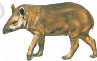
Fig. 6.5 : Tapir

The rainforest is rich in fauna. Birds such as toucans (Fig. 6.4), humming birds, macaw with their brilliantly coloured plumage, oversized bills for eating make them different from birds we commonly see in India. These birds also make loud sounds in the forests. Animals like monkeys, sloth and ant-eating tapirs are found here (Fig. 6.5). Various species of reptiles and snakes also thrive in these jungles. Crocodiles, snakes, pythons abound. Anaconda and boa constrictor are some of the species. Besides, the basin is home to thousands of species of insects. Several species of fishes including the flesh-eating Piranha fish is also found in the river. This basin is thus extraordinarily rich in the variety of life found there.