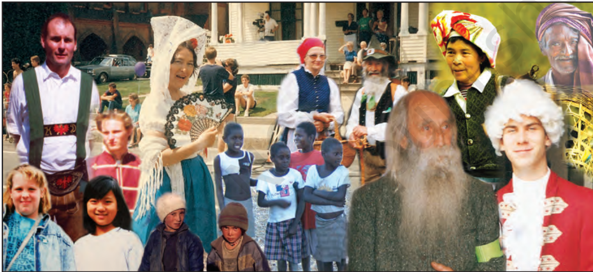
Fig. 6.1: People from various parts of the world

Renuka was excited. Shrikant Uncle was home after a gap of nearly four months. He was a wildlife photographer and travelled widely. Renuka's interest in wildlife and forests began at an early age, when her uncle introduced her to books on nature. Pictures of distant lands and people, who lived there, always fascinated her.