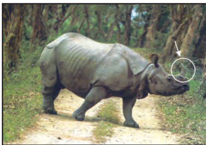
Fig. 6.11 : One horned rhinoceros

There is a variety of wildlife in the basin. Elephants, tigers, deer and monkeys are common. The one-horned rhinoceros is found in the Brahmaputra plain. In the delta area, Bengal tiger and crocodiles are found. Aquatic life abounds in the fresh river waters, the lakes and the Bay of Bengal Sea. The most popular varieties of the fish are the rohu, catla and hilsa. Fish and rice is the staple diet of the people living in the area.