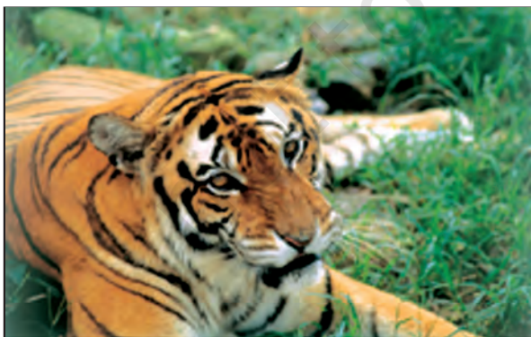
Fig. 6.14: Tiger in Manas Wildlife sanctuary

All the four ways of transport are well developed in the Ganga-Brahmaputra basin. In the plain areas the roadways and railways transport the people from one place to another. The waterways, is an effective means of transport particularly along the rivers. Kolkata is an important port on the River Hooghly. The plain area also has a large number of airports.