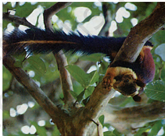
Fig. 5.3 (b) : Giant squirrel

endemic flora of the Pachmarhi Biosphere Reserve. Bison, Indian giant squirrel [Fig. 5.3 (b)] and flying squirrel are endemic fauna of this area. Professor Ahmad explains that the destruction of their habitat, increasing population and introduction of new species may affect the natural habitat of endemic species and endanger their existence.