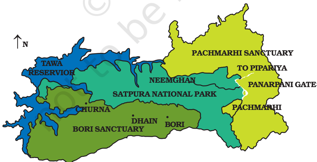
Fig. 5.1 : Pachmarhi Biosphere Reserve