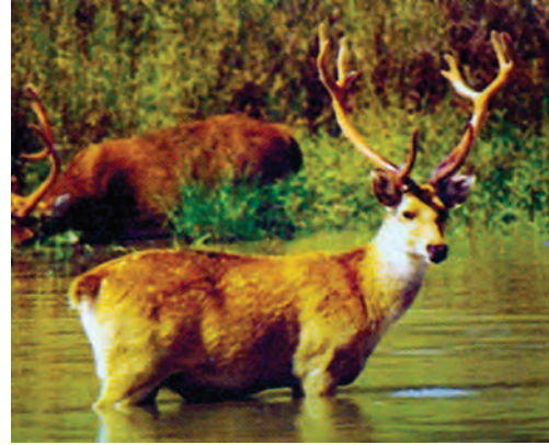
Fig. 5.6 : Barasingha

animals has become difficult because of disturbances in their natural habitat. Professor Ahmad tells them that in order to protect plants and animals strict rules are imposed in all National Parks. Human activities such as grazing, poaching, hunting, capturing of animals or collection of firewood, medicinal plants, etc. are not allowed