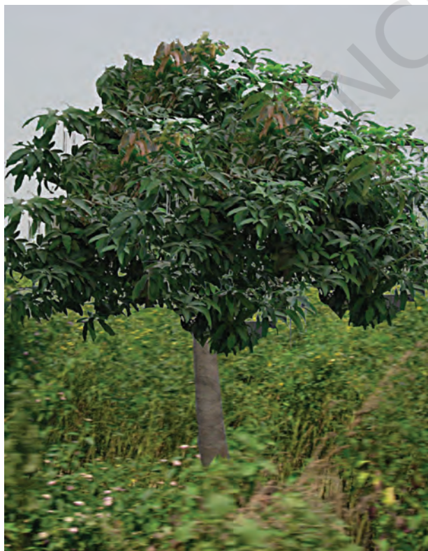
Fig. 5.3 (a) : Wild Mango

Madhavji shows sal and wild mango (Fig. 5.3 (a)) as two examples of the