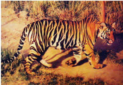
Fig. 5.4 : Tiger

Tiger (Fig. 5.4) is one of the many species which are slowly disappearing from our forests. But, the Satpura Tiger Reserve is unique in the sense that a significant increase in the population of tigers has been seen here. Once upon a time, animals like lions, elephants, wild