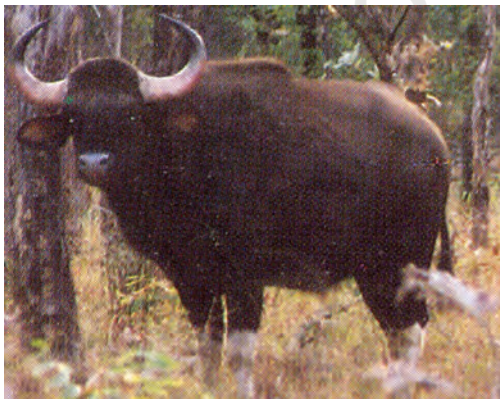
Fig. 5.5 : Wild buffalo

buffaloes (Fig. 5.5) and barasingha (Fig. 5.6) were also found in the Satpura National Park. Animals whose numbers are diminishing to a level that they might face extinction are known as the endangered animals . Boojho is reminded of the dinosaurs which became extinct a long time ago. Survival of some