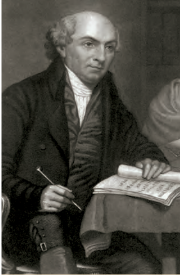
Fig. 6 – William Carey was a Scottish missionary who helped establish the Serampore Mission

The argument for practical education was strongly criticised by the Christian missionaries in India in the nineteenth century. The missionaries felt that education should attempt to improve the moral character of the people, and morality could be improved only through Christian education.