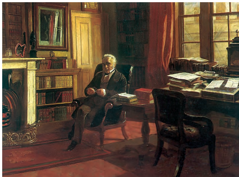
Fig. 4 – Thomas Babington Macaulay in his study

“a single shelf of a good European library was worth the whole native literature of India and Arabia”. He urged that the British government in India stop wasting public money in promoting Oriental learning, for it was of no practical use.