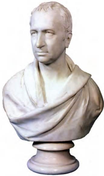
Fig. 2 – Henry Thomas Colebrooke

He was a scholar of Sanskrit and ancient sacred writings of Hinduism.