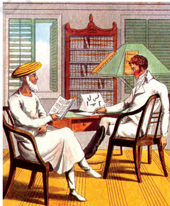
Fig. 1 – William Jones learning Persian

In 1783, a person named William Jones arrived in Calcutta. He had an appointment as a junior judge at the Supreme Court that the Company had set up. In addition to being an expert in law, Jones was a linguist . He had studied Greek and Latin at Oxford, knew French and English, had picked up Arabic from a friend, and had also learnt Persian. At Calcutta, he began spending many hours a day with pandits who taught him the subtleties of Sanskrit language, grammar and