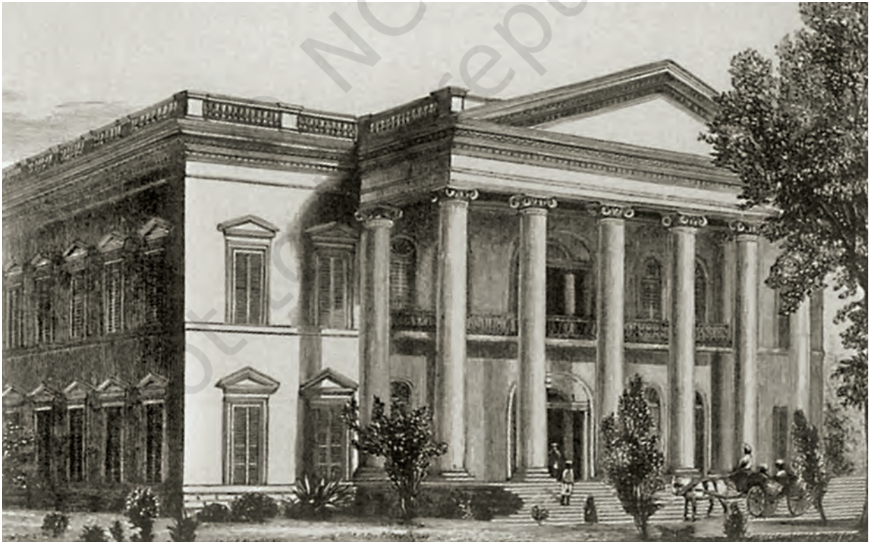
Fig. 7 – Serampore College on the banks of the river Hooghly near Calcutta

Over the nineteenth century, missionary schools were set up all over India. After 1857, however, the British government in India was reluctant to directly support missionary education. There was a feeling that any strong attack on local customs, practices, beliefs and religious ideas might enrage “native” opinion.