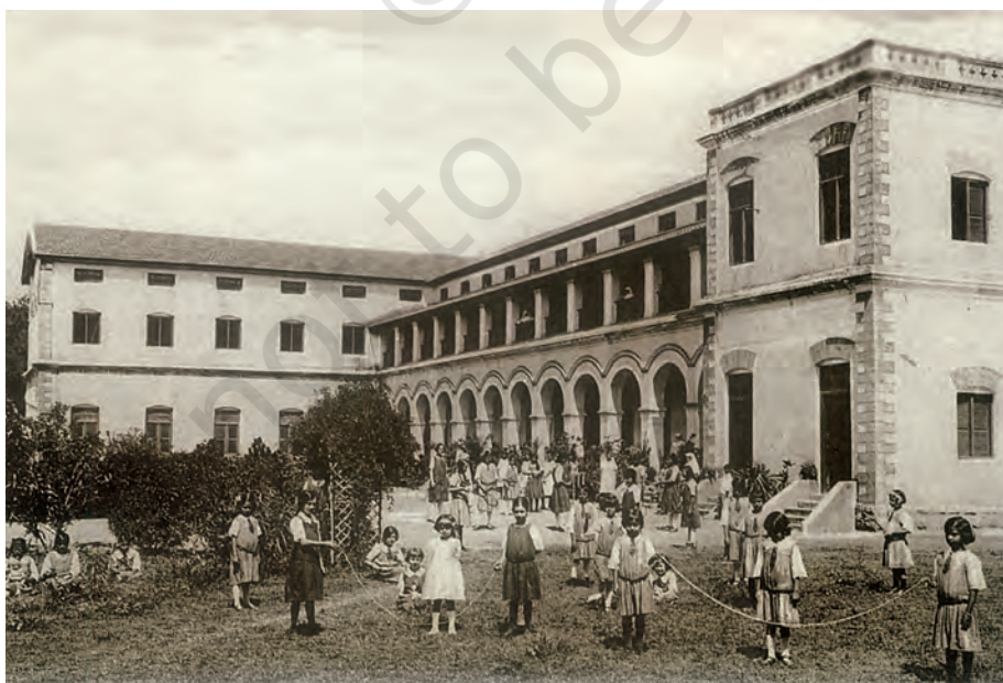
Fig. 12 – Children playing in a missionary school in Coimbatore, early twentieth century

Many individuals and thinkers were thus thinking about the way a national educational system could be fashioned. Some wanted changes within the system set up by the British, and felt that the system could be extended so as to include wider sections of people. Others urged that alternative systems be created so that people were educated into a culture that was truly national. Who was to define what was truly national? The debate about what this “national education” ought to be continued till after independence.