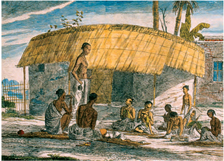
Fig. 8 – A village pathshala

Adam discovered that this flexible system was suited to local needs. For instance, classes were not held during harvest time when rural children often worked in the fields. The pathshala started once again when the crops had been cut and stored. This meant that even children of peasant families could study.