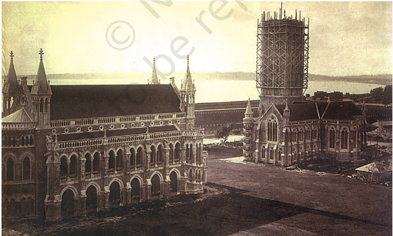
Fig. 5 – Bombay University in the nineteenth century

We must emphatically declare that the education which we desire to see extended in India is that which has for its object the diffusion of the improved arts, services, philosophy, and literature of Europe, in short, European knowledge.