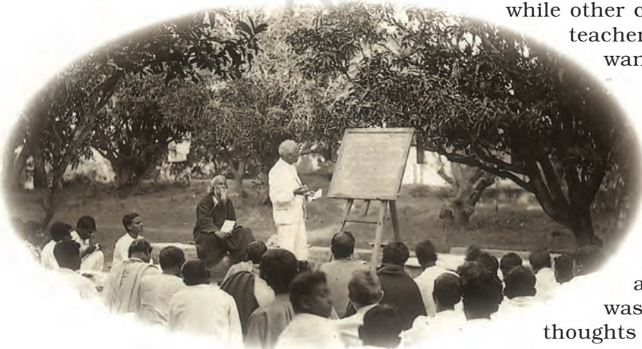
Fig. 11 – A class in progress in Santiniketan in the 1930s Notice the surroundings – the trees and the open spaces.

The experience of his schooldays in Calcutta shaped Tagore’s ideas of education. On growing up, he wanted to set up a school where the child was happy, where she could be free and creative, where she was able to explore her own thoughts and desires. Tagore felt